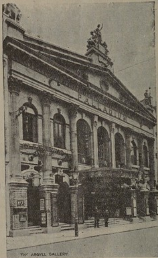
THE ARGYLL GALLERIES. 7, ARGYLL STREET, OXFORD CIRCUS, W. 1.