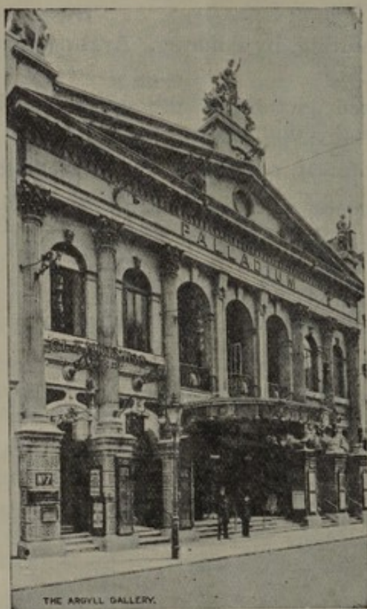
THE ARGYLL GALLERY, 7, ARGYLL STREET, OXFORD CIRCUS, W. 1.