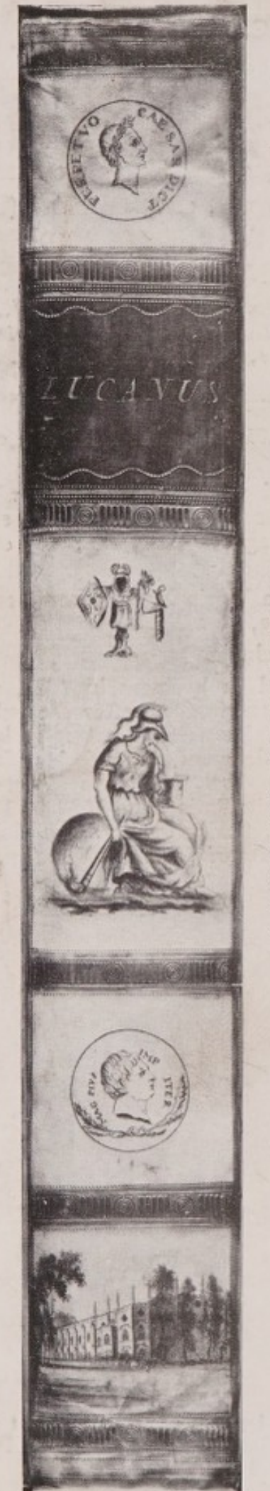
Reduced Facsimile of the Back of No. 234