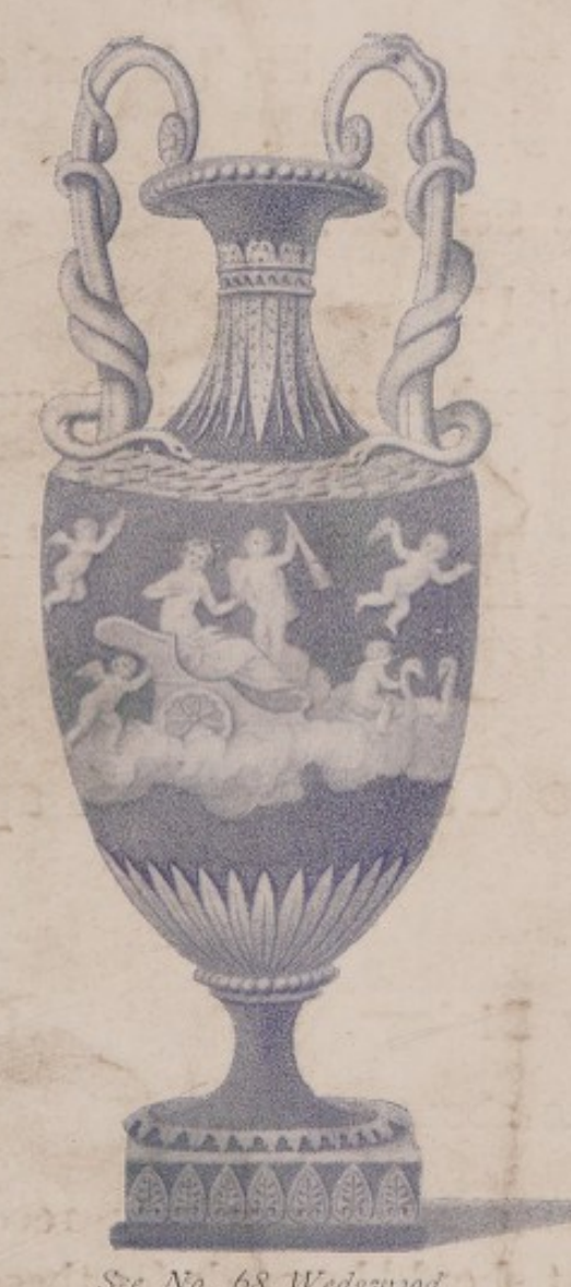
See No. 68 Wedgwood.