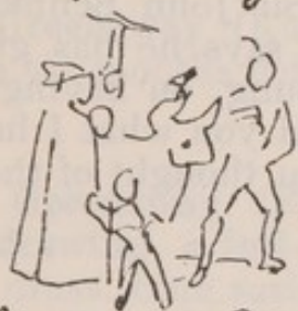
"The Goblin Bird"