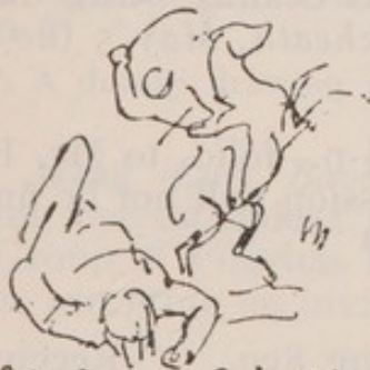
"The Dragon Gieat"