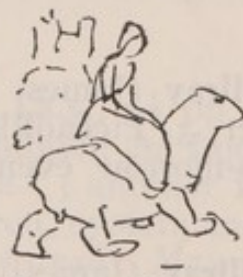
"Eastward of the Sun and Westward of the Moon"