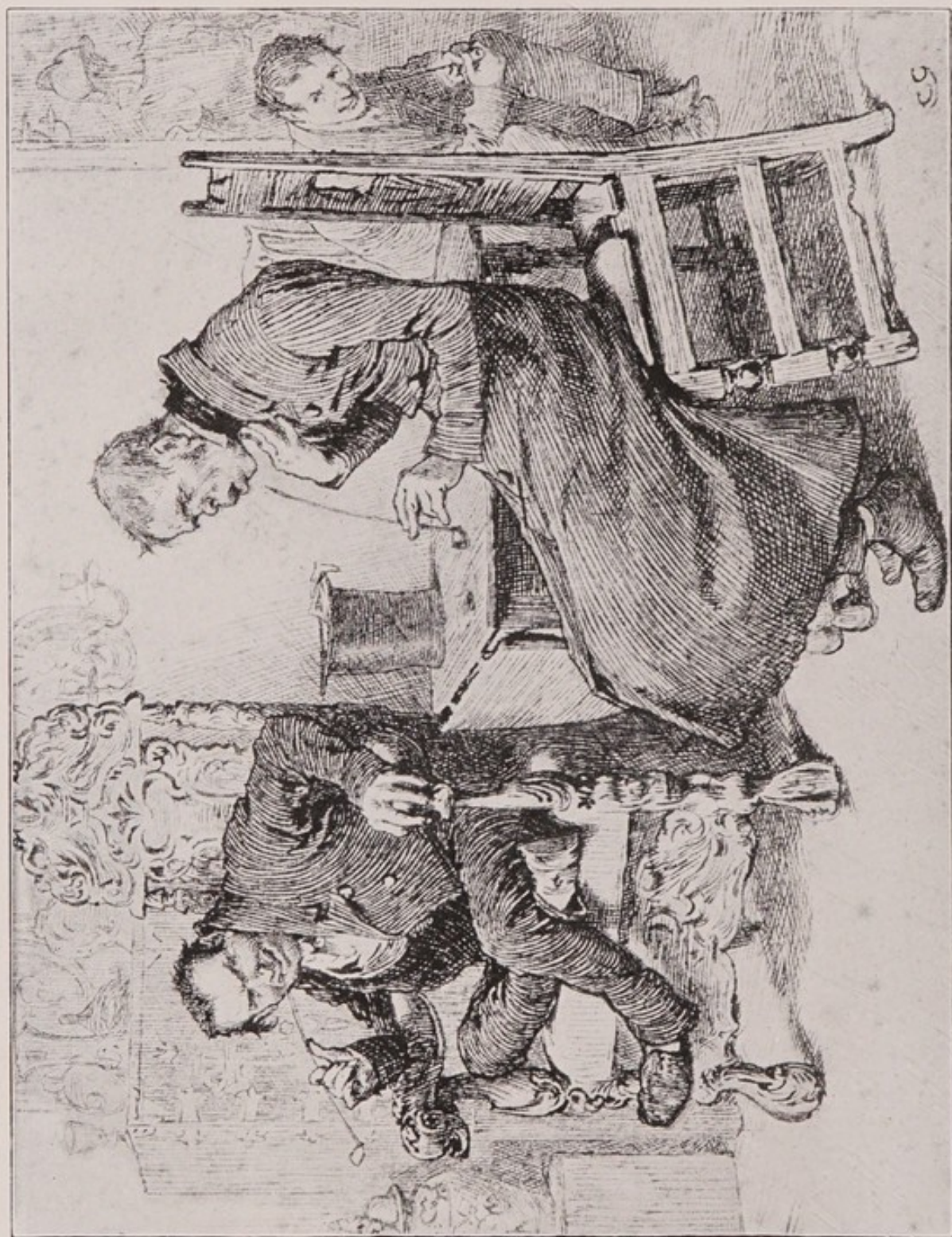
NO. 69. GREEN.