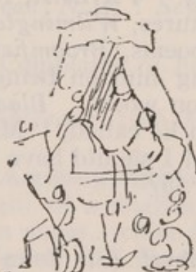
"The Enchanted Crow"