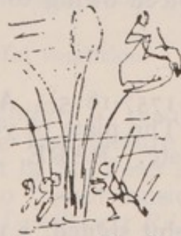
"The Prince of the Flow- ers"