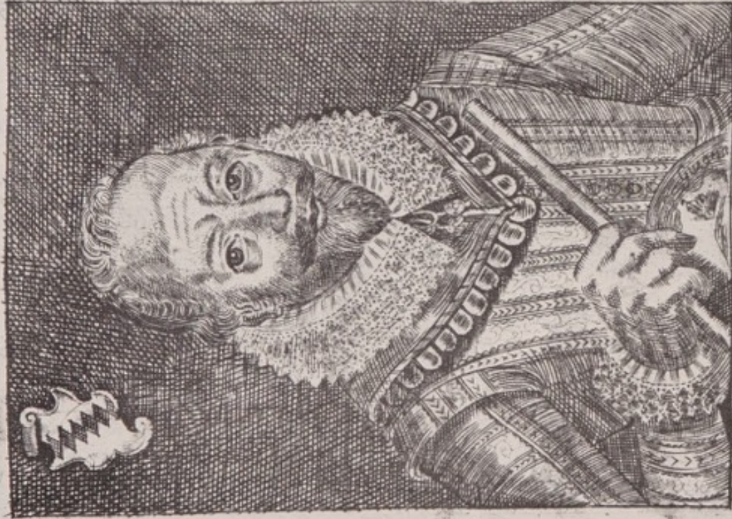
St. Walter Raleigh K t