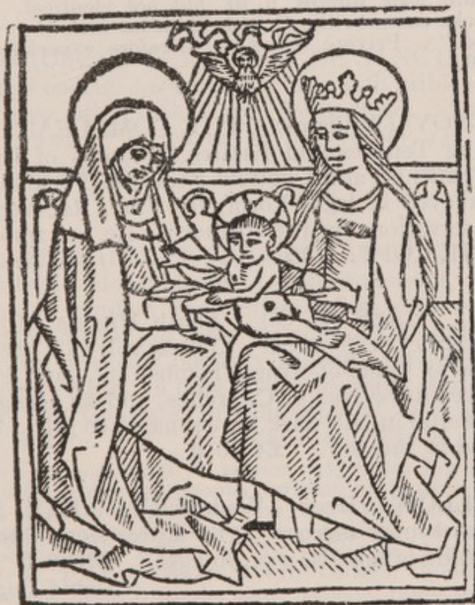
NO. 133. IMITATIO CHRISTI.