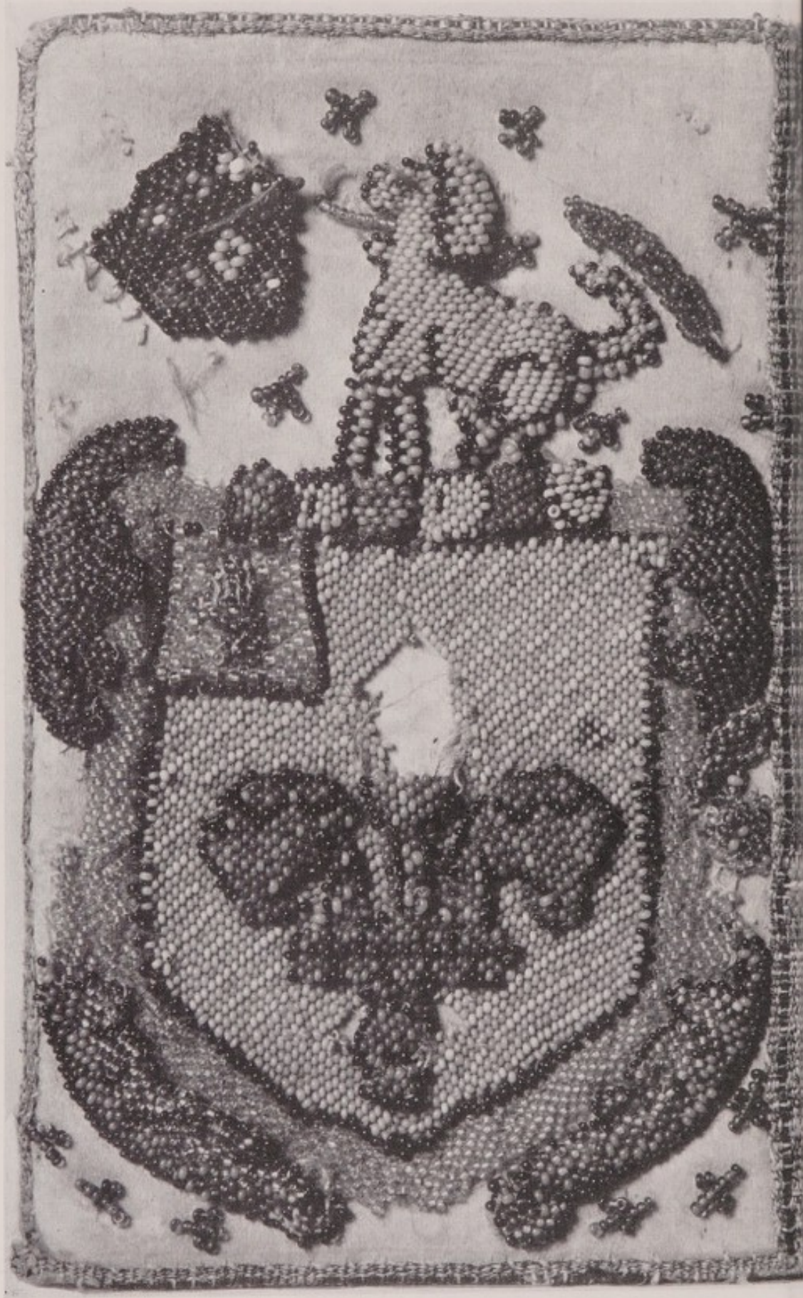
NO. 33. ARMORIAL BEADWORK BINDING.