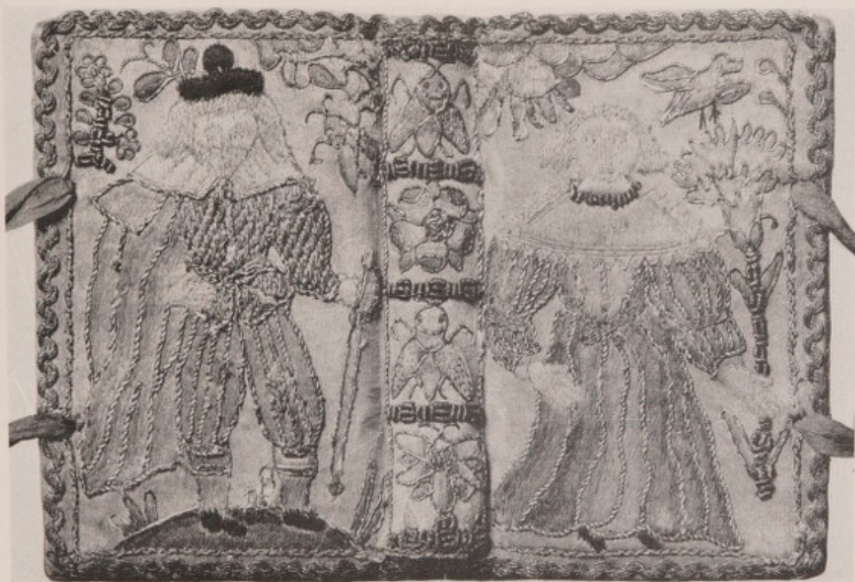
NO. 158. NEEDLEWORK BINDING.