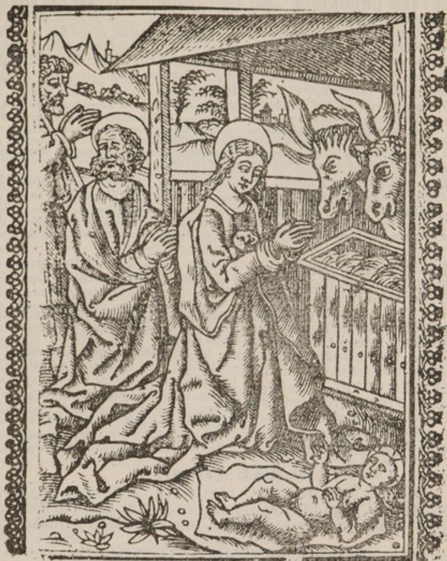
An Italian Biblia Pauperum.

133 BLOCK BOOK. —OPERA NOVA CONTEMPLATIVA.....Nouvamente stampata, sm. 8vo, 49 (should be 64) leaves, EACH PAGE CUT ENTIRELY ON WOOD, a line border enclosing explicative text and illustration, perfect state throughout, the cuts free from erasures, old sheep (rubbed), RARE, 1 guineas