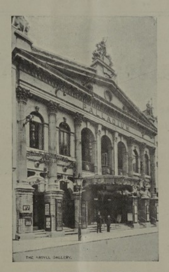
THE ARGYLL GALLERIES, 7, ARGYLL STREET, OXFORD CIRCUS, W. 1.