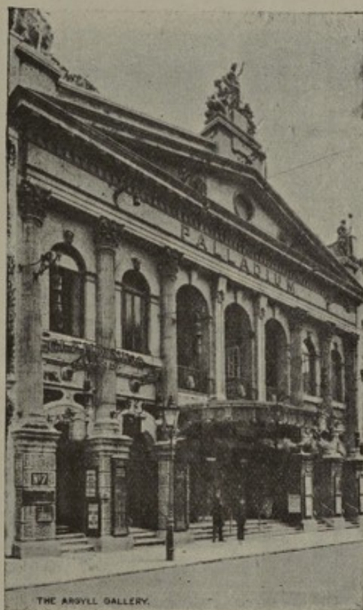
THE ARGYLL GALLERIES, 7, ARGYLL STREET, OXFORD CIRCUS, W. 1.