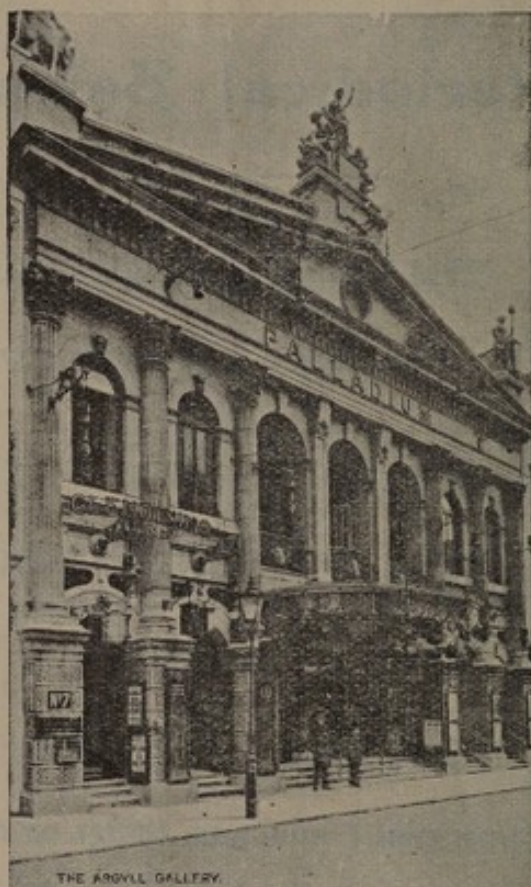
THE ARGYLL GALLERIES. 7, ARGYLL STREET OXFORD CIRCUS, W. 1.