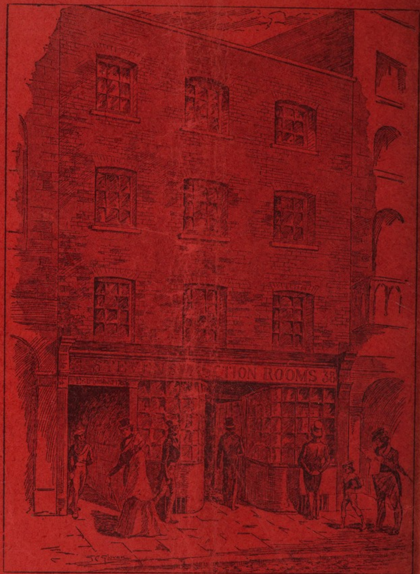
STEVENS' IN THE 18TH CENTURY