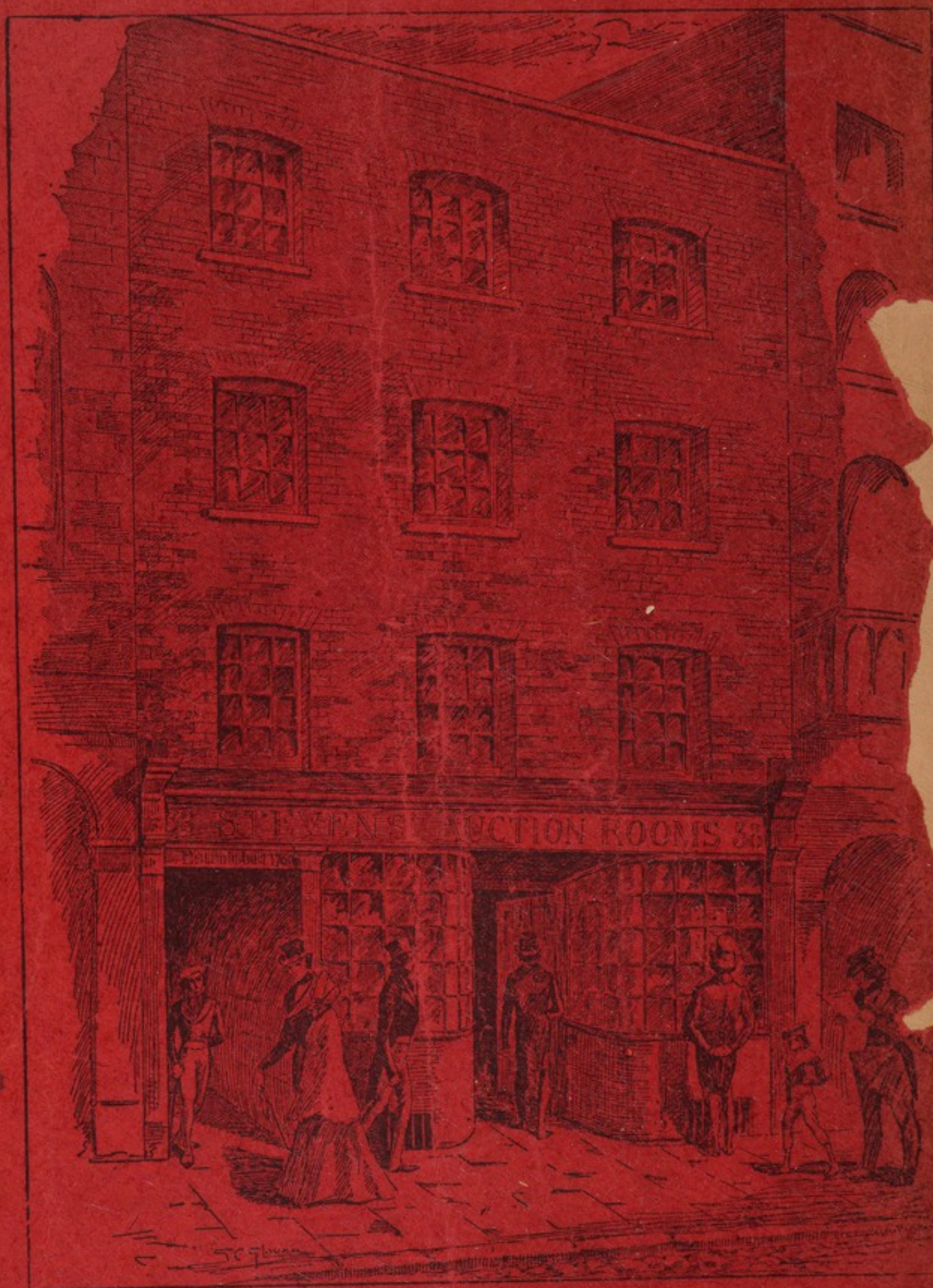
STEVENS' IN THE 18TH CENTURY