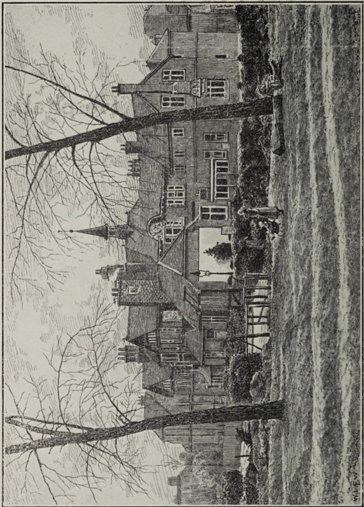
WOODFORD JUBILEE HOSPITAL.