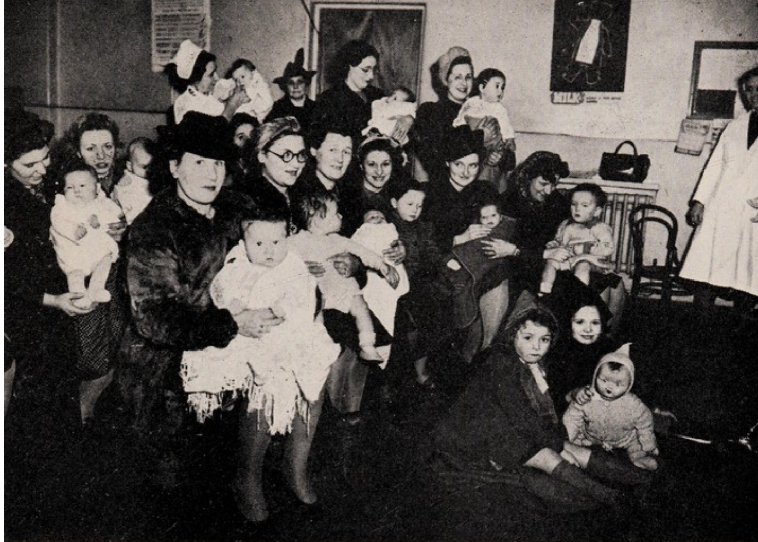
THE FAIREST FLOWERS O' THE SEASON