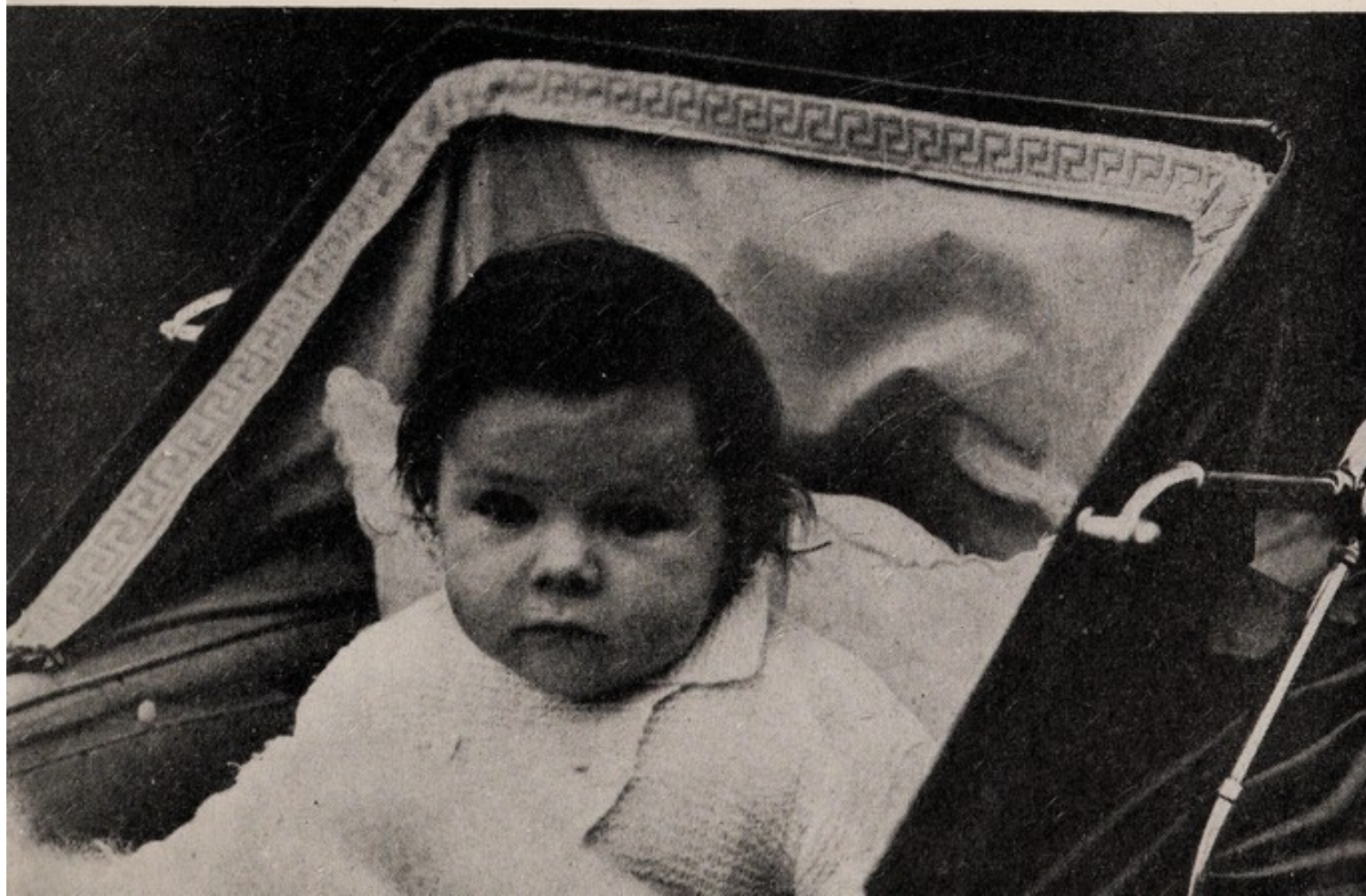
FATHER'S GONE A-HUNTING