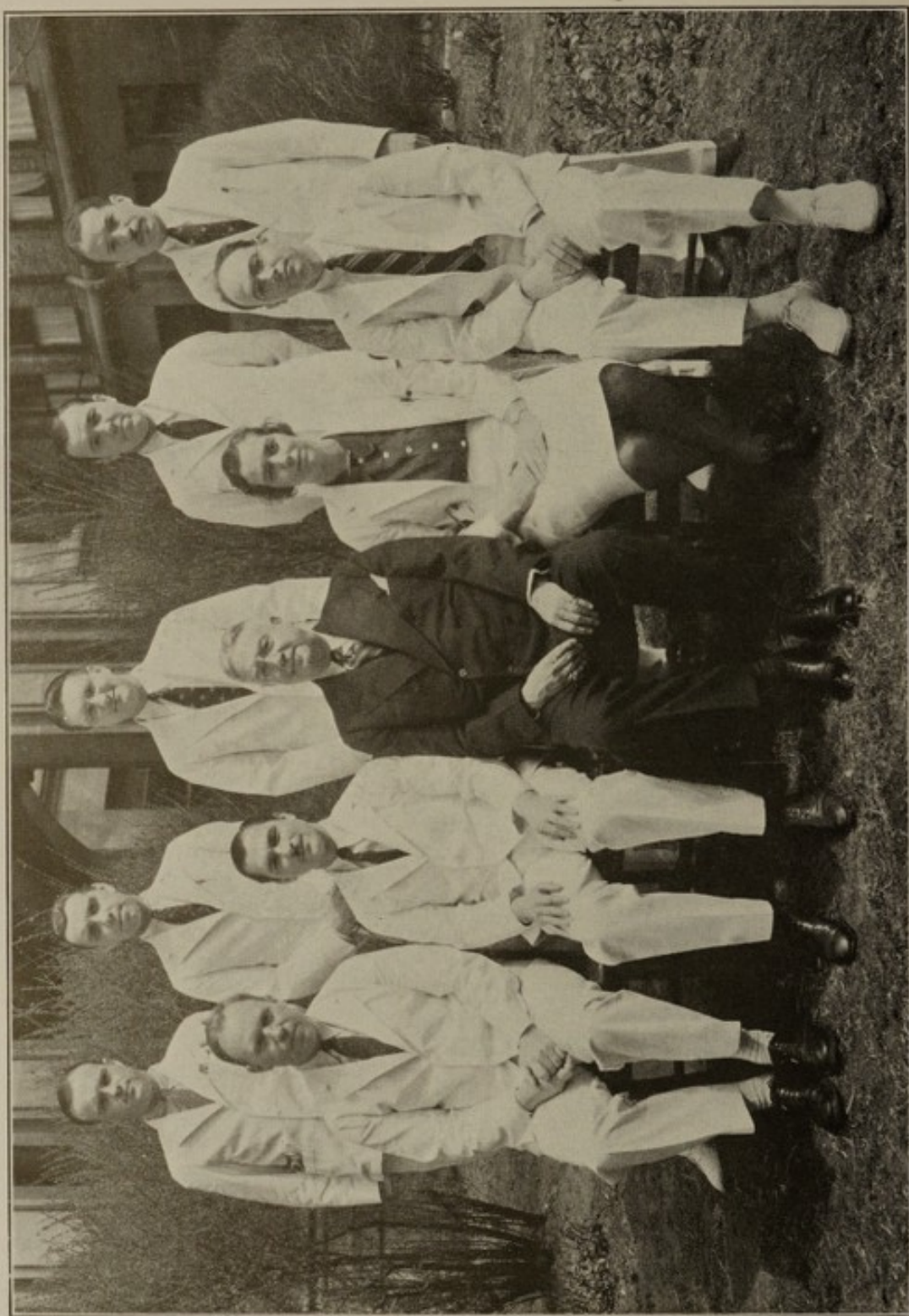
CHIEF SURGEON AND RESIDENT STAFF—1937-1938