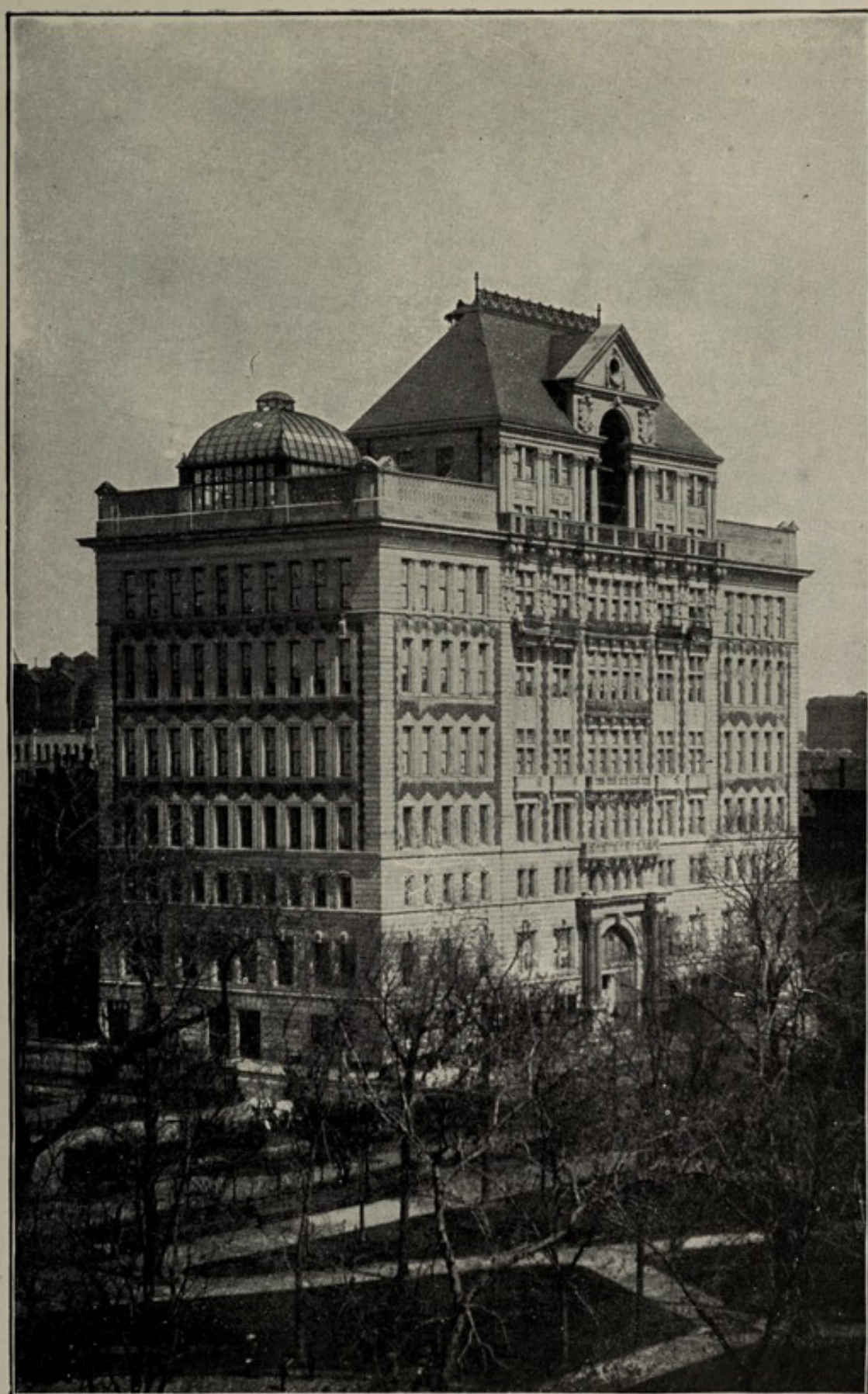
THE LYING-IN HOSPITAL, SECOND AVENUE, 17TH AND 18TH STREETS