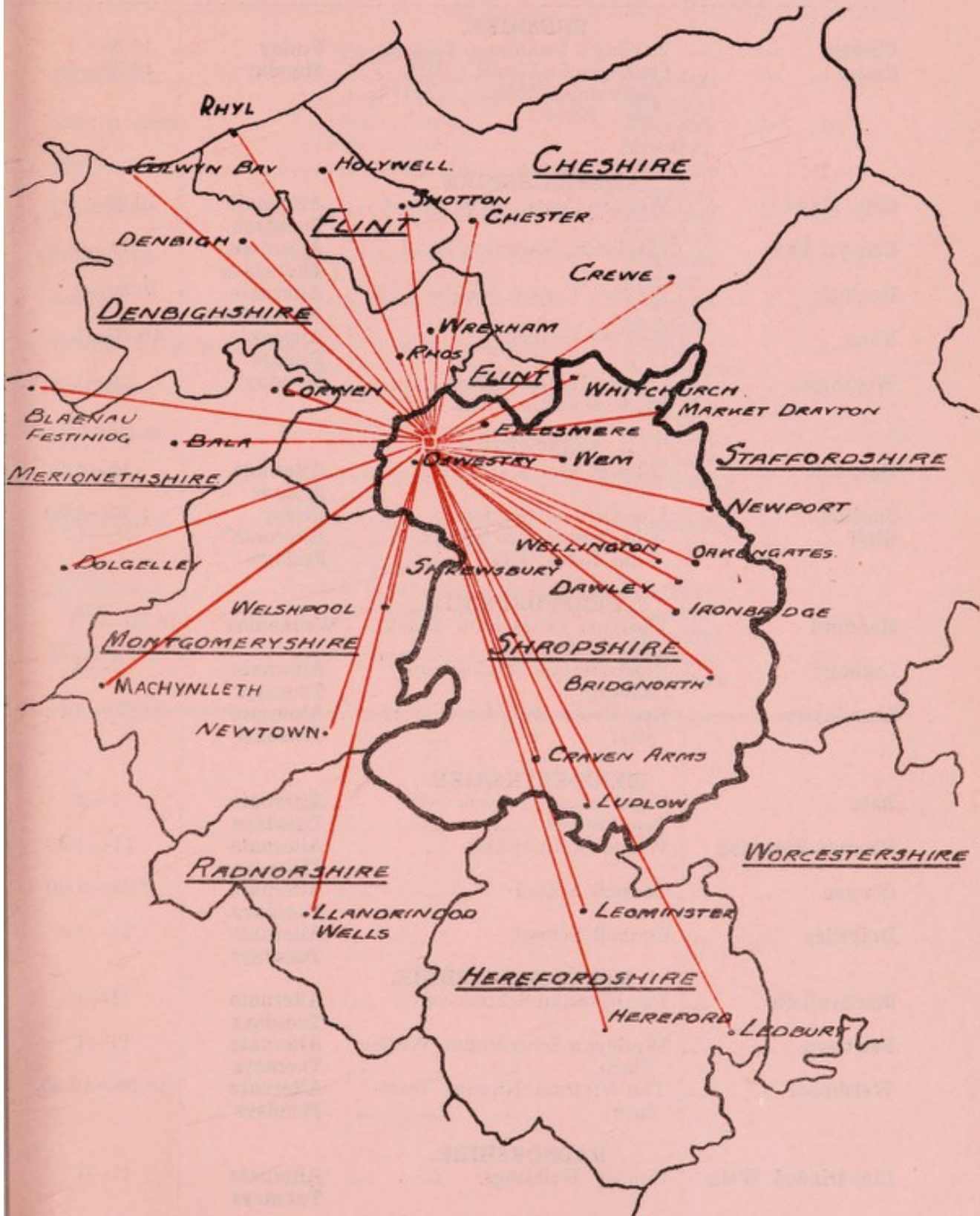
The above Map shows Area and Situation of the Clinics.