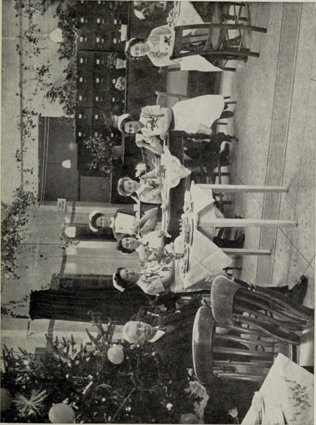
"THE OUT-PATIENT DEPARTMENT, CHRISTMAS DAY, 1947"