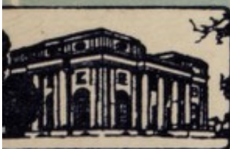
GROVELANDS HOSPITAL (Recovery)