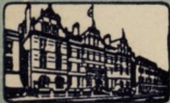
ROYAL NORTHERN HOSPITAL