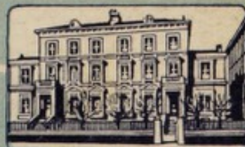
MATERNITY NURSING ASSOCN.