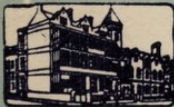
ROYAL CHEST HOSPITAL