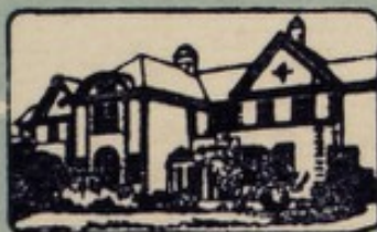
RECKITT CONVALESCENT HOME