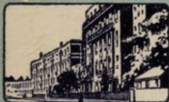
ST. DAVID'S WING (for Private Patients)