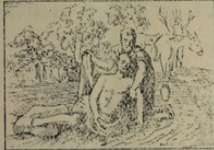
THE GOOD SAMARITAN