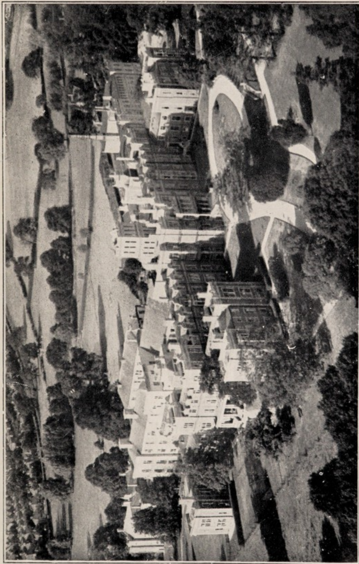
AERIAL VIEW OF THE ROYAL EARLSWOOD INSTITUTION SHOWING A PORTION OF THE GROUNDS