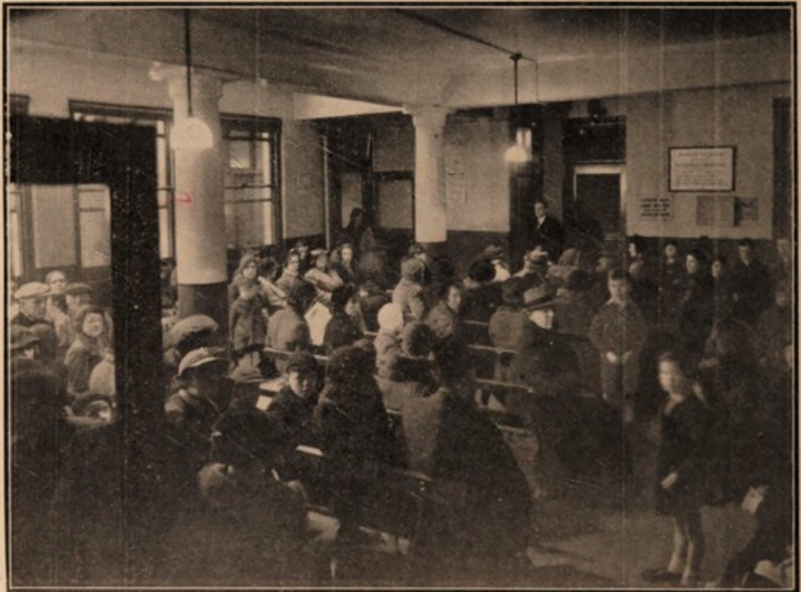
OUT-PATIENTS WAITING HALL