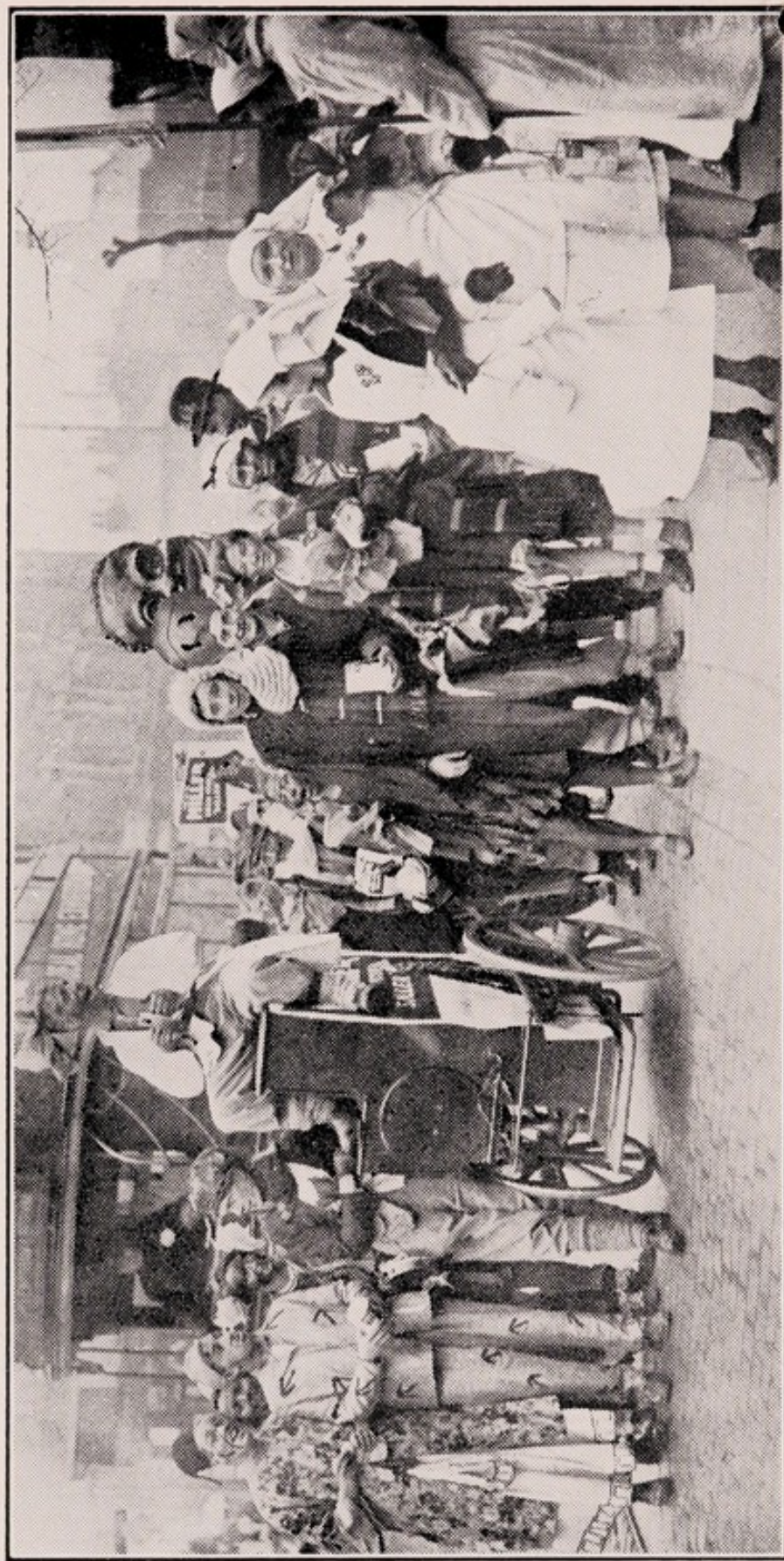
STUDENTS OF GOLDSMITH'S COLLEGE IN SOME OF THE FANCY COSTUMES THEY WORE ON FLAG DAY.