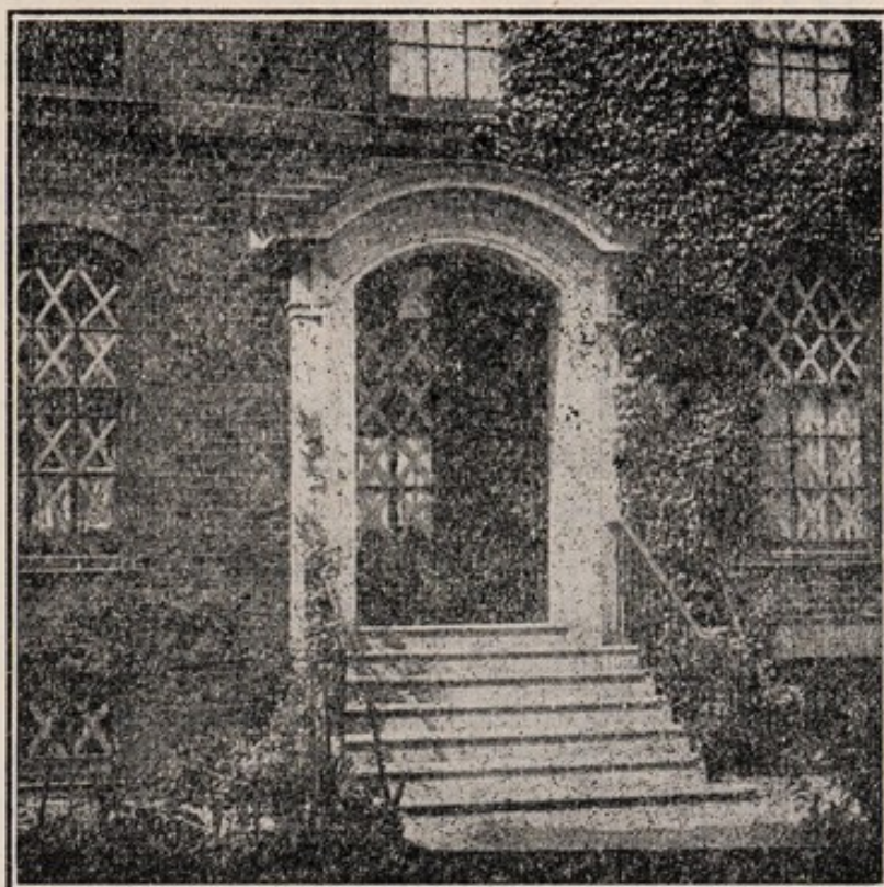
Private Ward Annexe—Opened October 3rd, 1940.