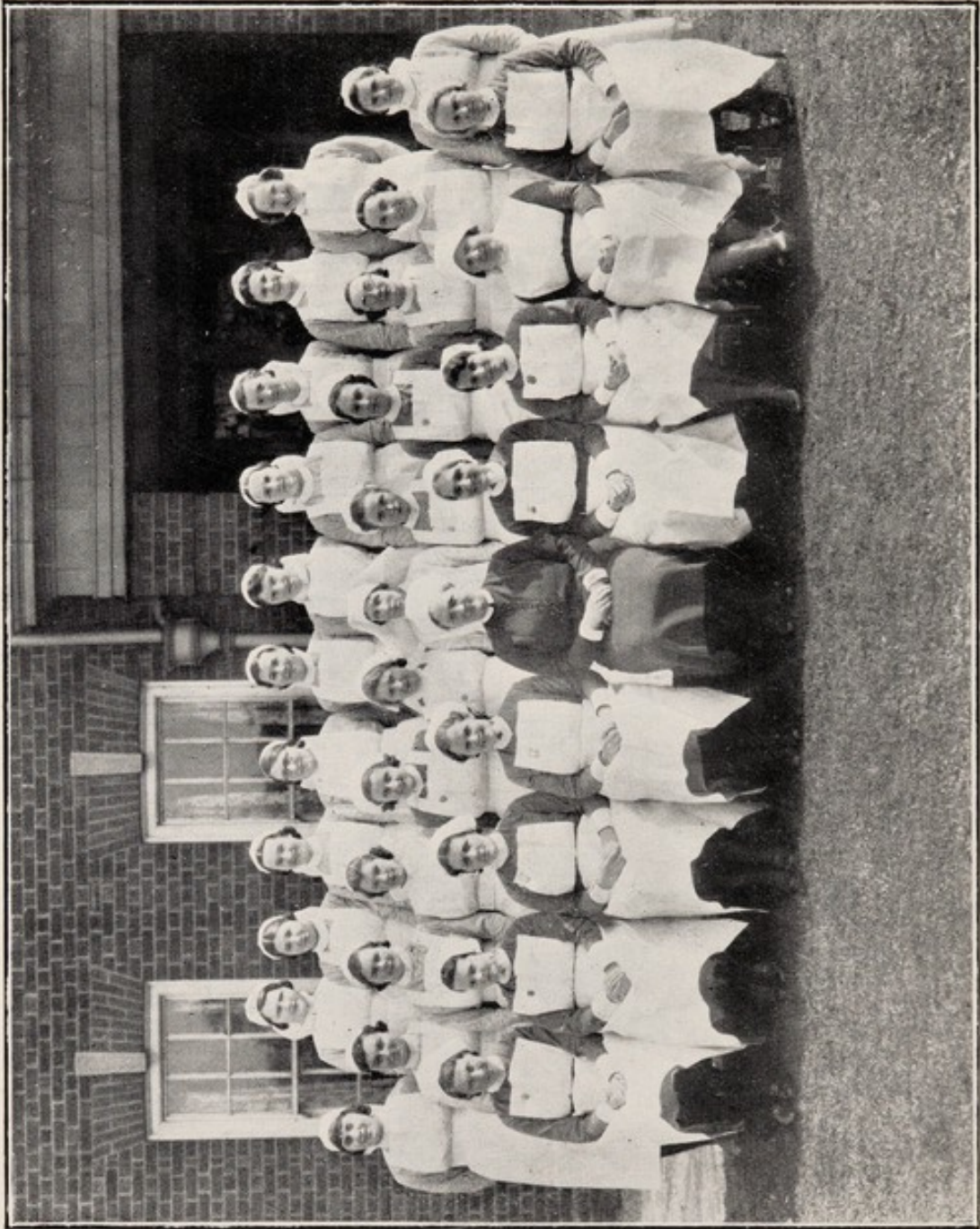
NURSING STAFF - MARCH, 1939