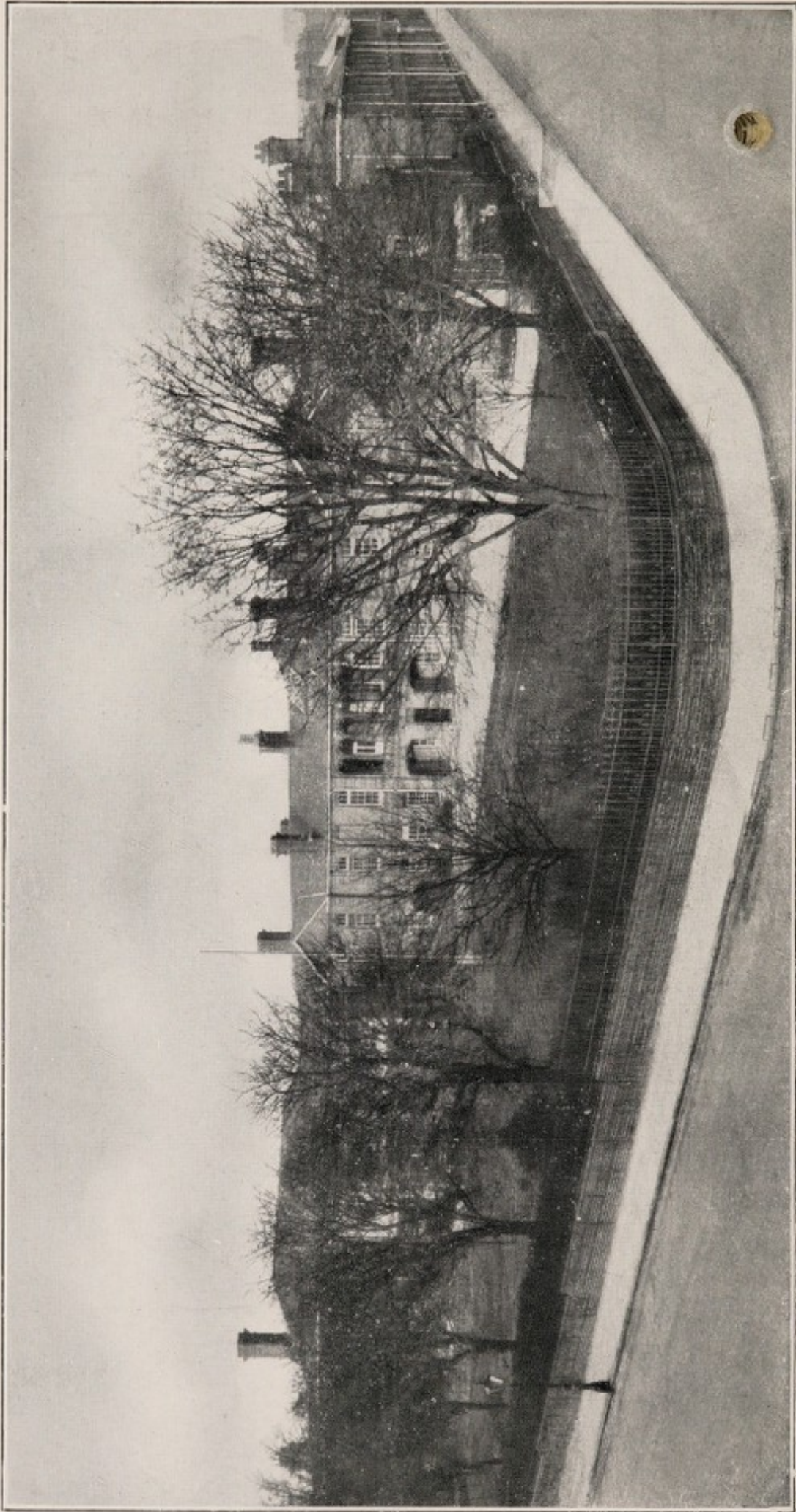
THE LOWESTOFT AND NORTH SUFFOLK HOSPITAL.