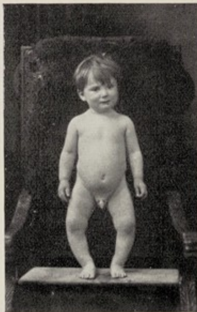
2 On Admission Jan 1935. Age 2\frac{1}{2} years.