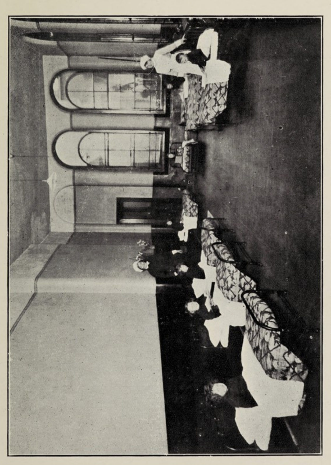
PORTION OF WARD—GREENGATE HOSPITAL AND OPEN-AIR SCHOOL.