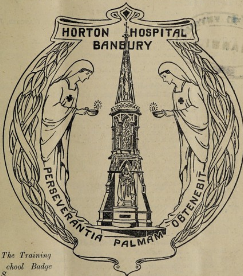
The Training School Badge

A complete Training School for Nurses under the General Nursing Council Scheme