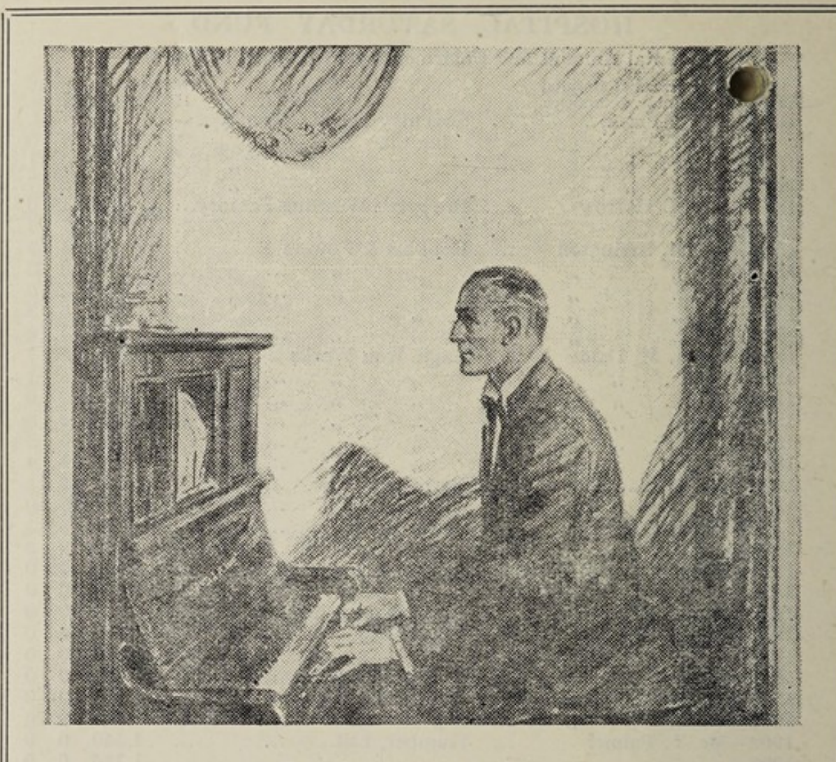
The World forgetting — The cares of the day forgot.

Music is the finest recreation for the home and