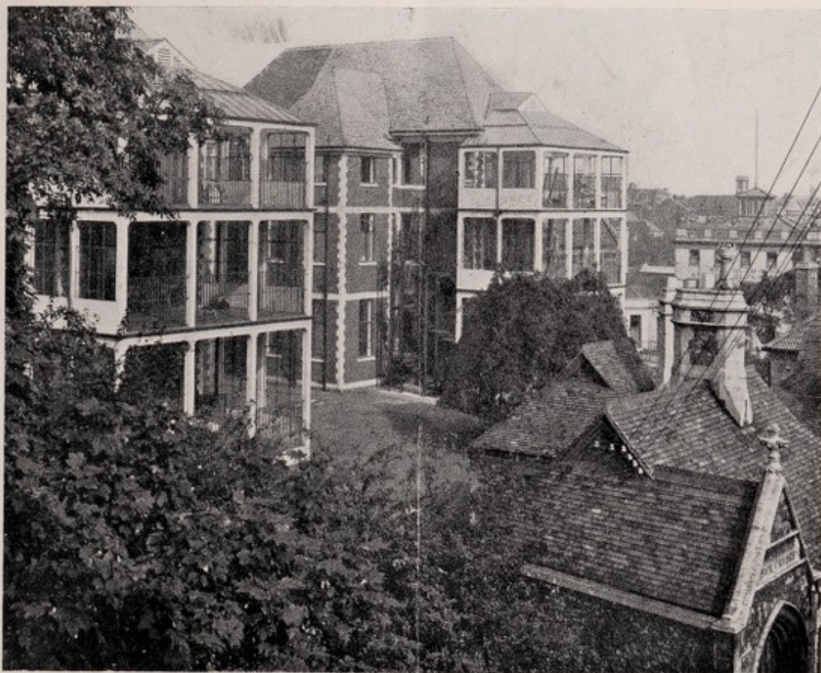
The Children's Hospital, St. Michael's Hill, Bristol.

(Usually known as the Children's Hospital)