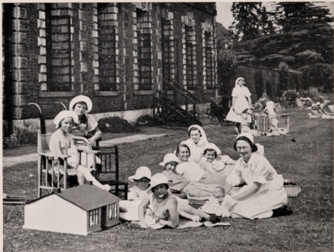
The Girls at Play