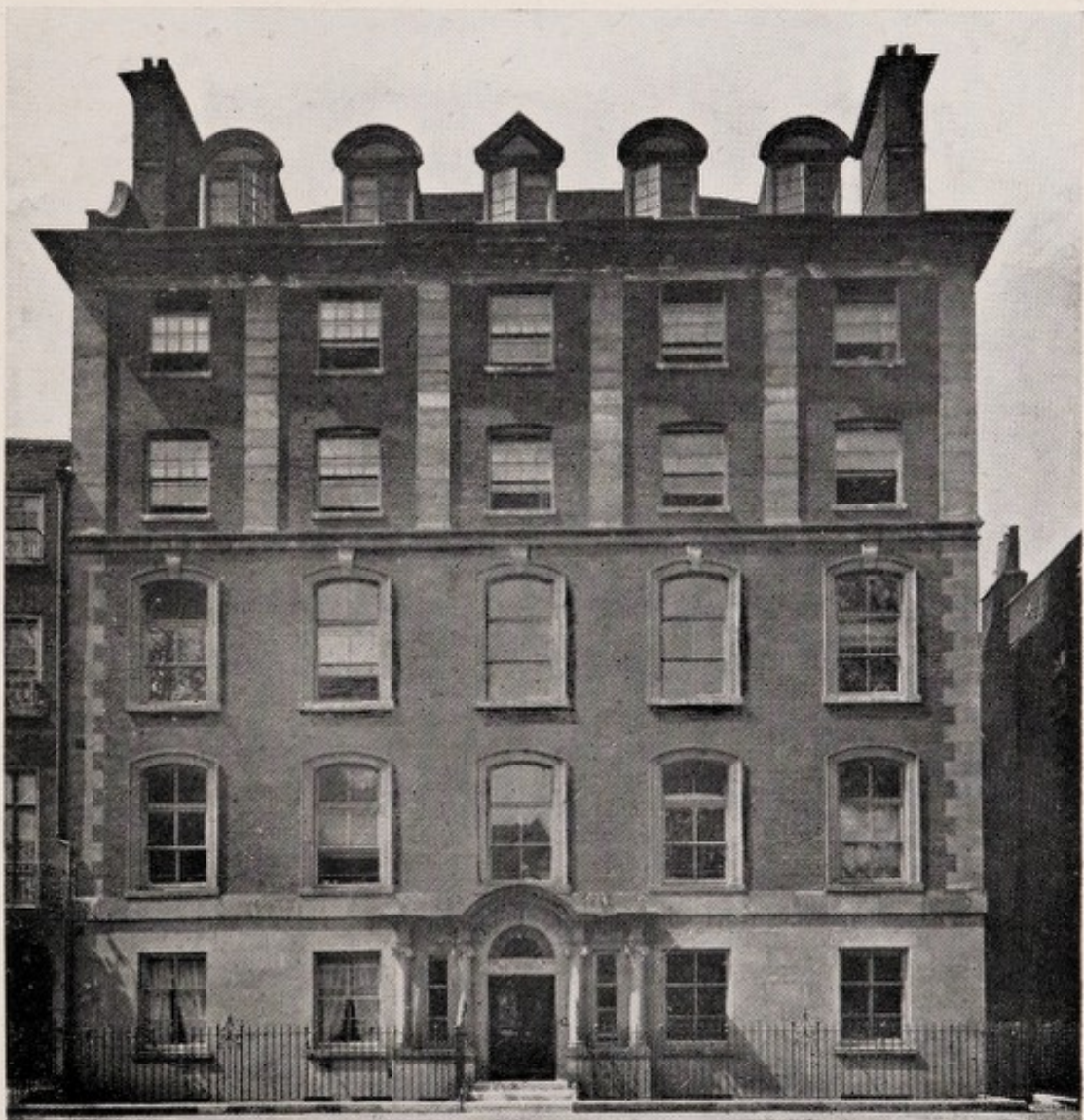
Second Hospital, Queen Square, 1899-20