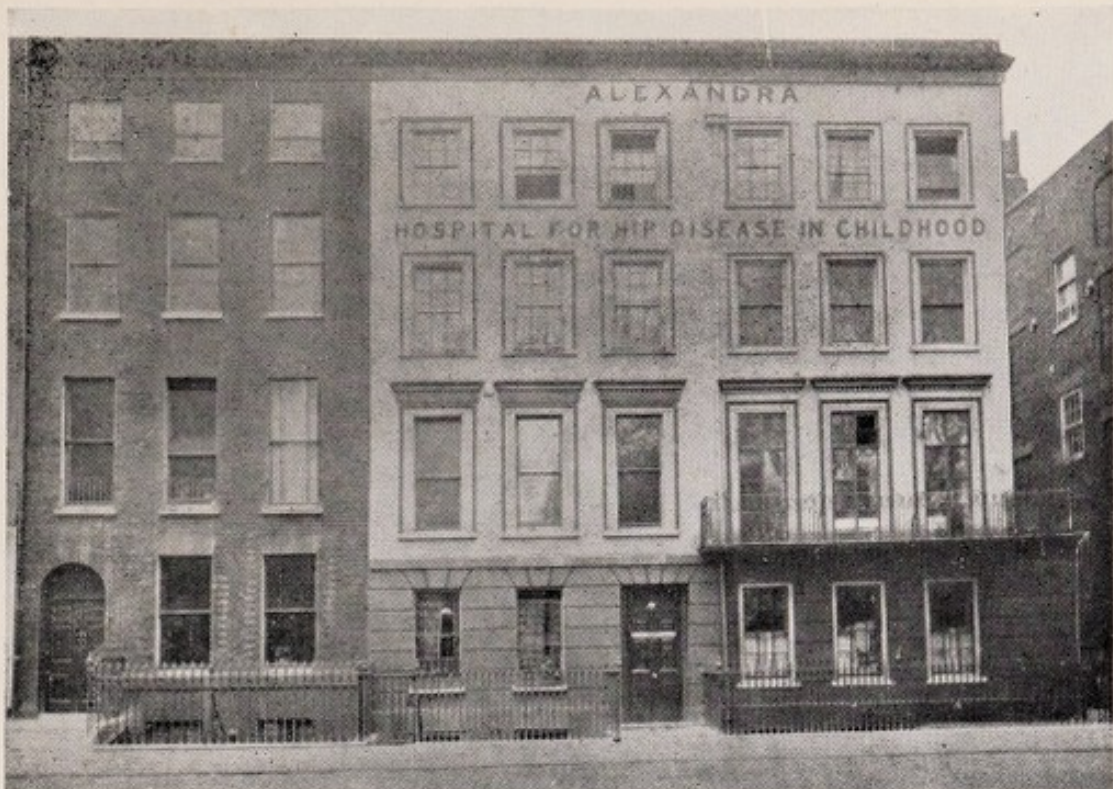
Original Hospital in Queen Square, 1867-99