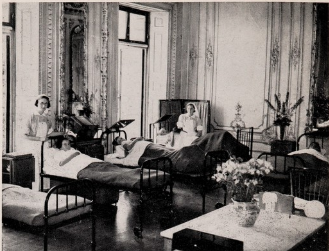
A Corner of the Girls' Ward