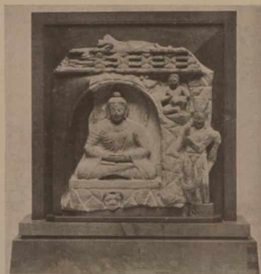
SALE NOV. 23RD.—Indian Sculpture from Muttra, the Visit of Sakra to Sakysmuni: c. A.D. 200—300.

Illustrated catalogues (5 plates), price 1s.