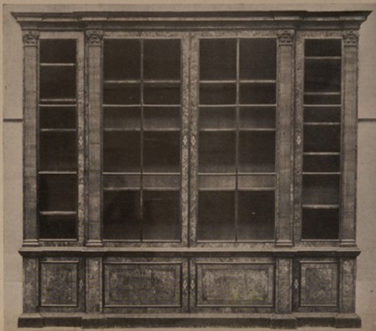
SALE NOV. 11TH.—Queen Anne Walnut China cabinet or bookcase 10ft. wide 9ft. high.