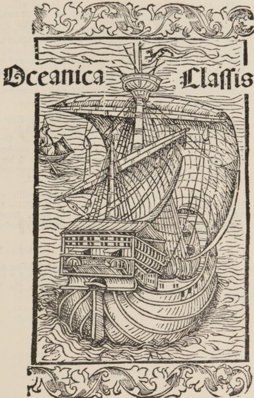
Woodcut on f. 9 recto.

(2) On verso of title. Arms of Castile and Leon.