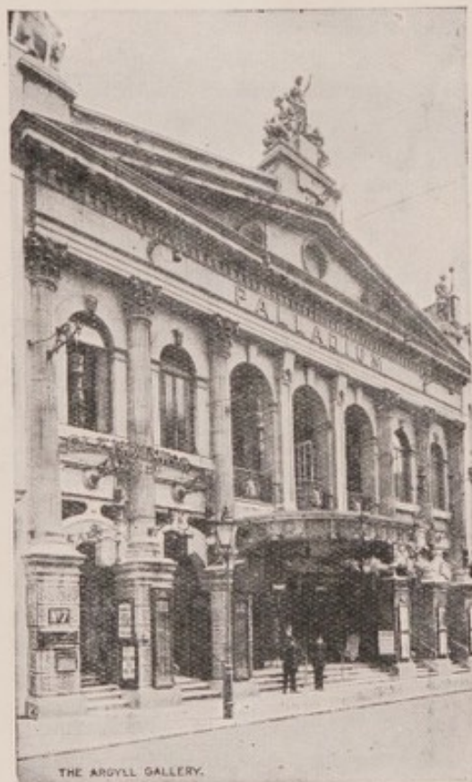
THE ARGYLL GALLERIES, 7, ARGYLL STREET, OXFORD CIRCUS, W.1.