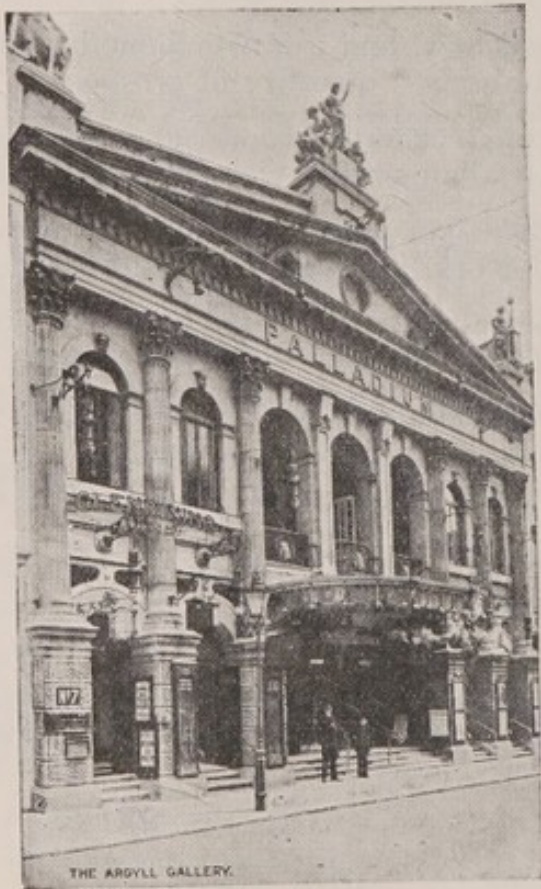
THE ARGYLL GALLERY, 7, ARGYLL STREET, OXFORD CIRCUS, W.1.