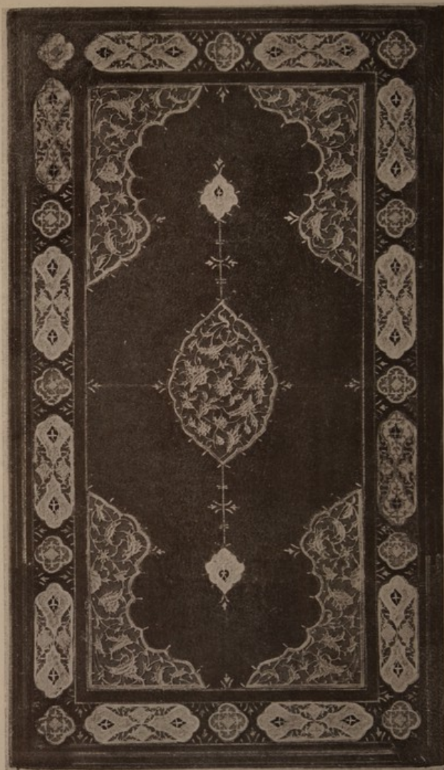
LOT 97. DOUBLURE