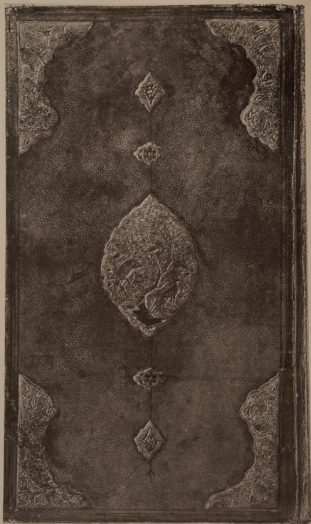
LOT 97 COVER