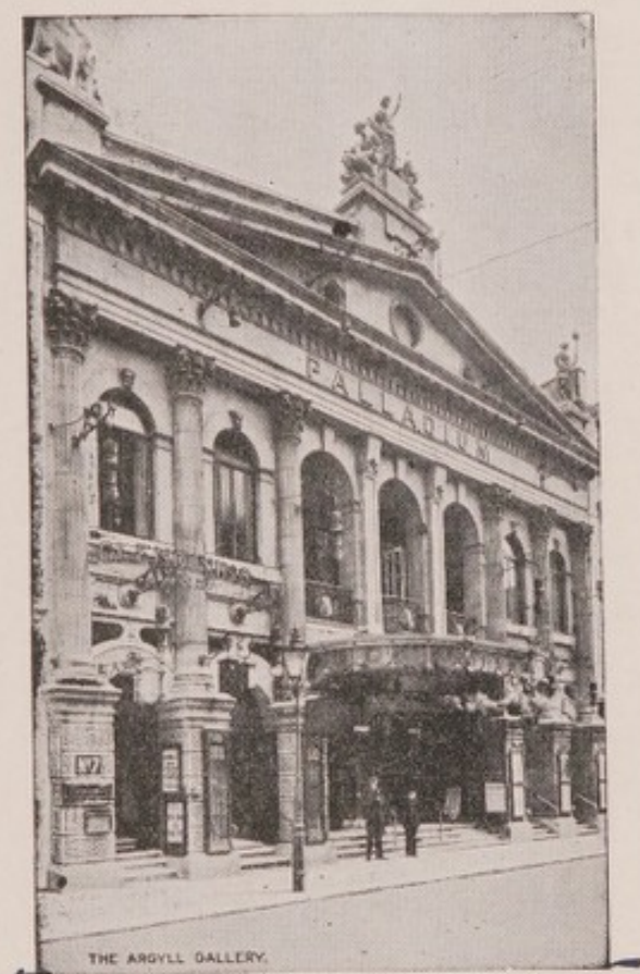
THE ARGYLL GALLERIES, 7, ARGYLL STREET, OXFORD CIRCUS, W. 1.