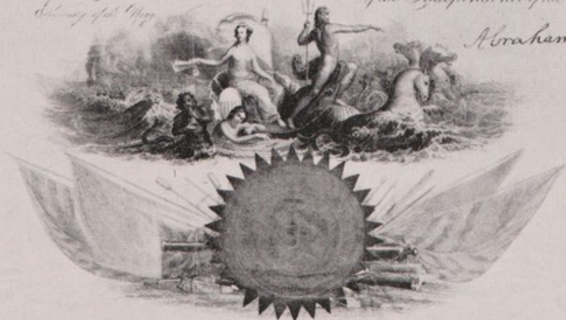
ABRAHAM LINCOLN. Document Signed. See item No. 1669.