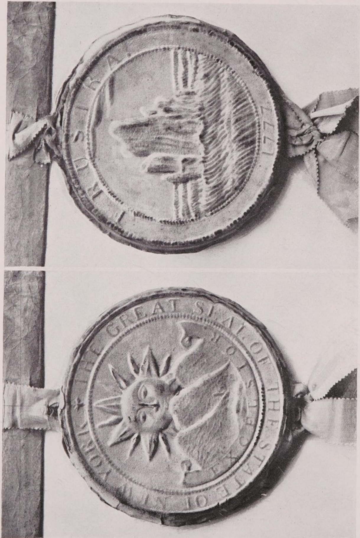
New York. Great Seal of New York, attached to a document signed by George Clinton, the Governor. See item No. 1777.