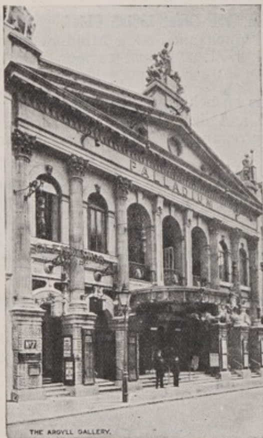
THE ARGYLL GALLERIES, 7, ARGYLL STREET, OXFORD CIRCUS, W.1.