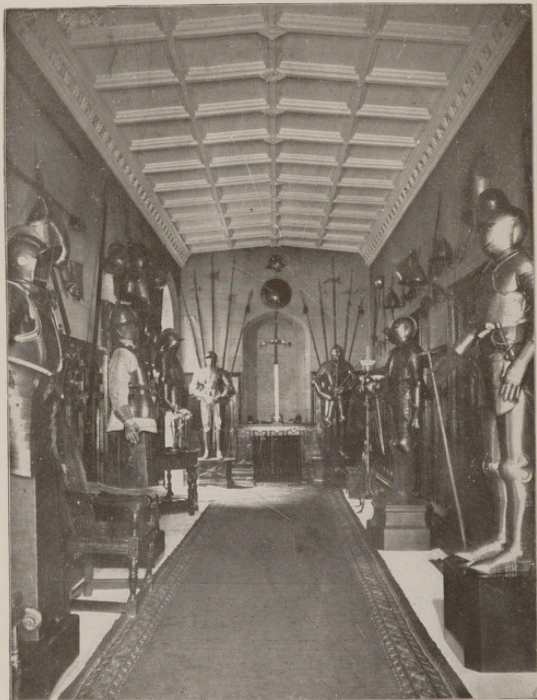
General View of the Collection.