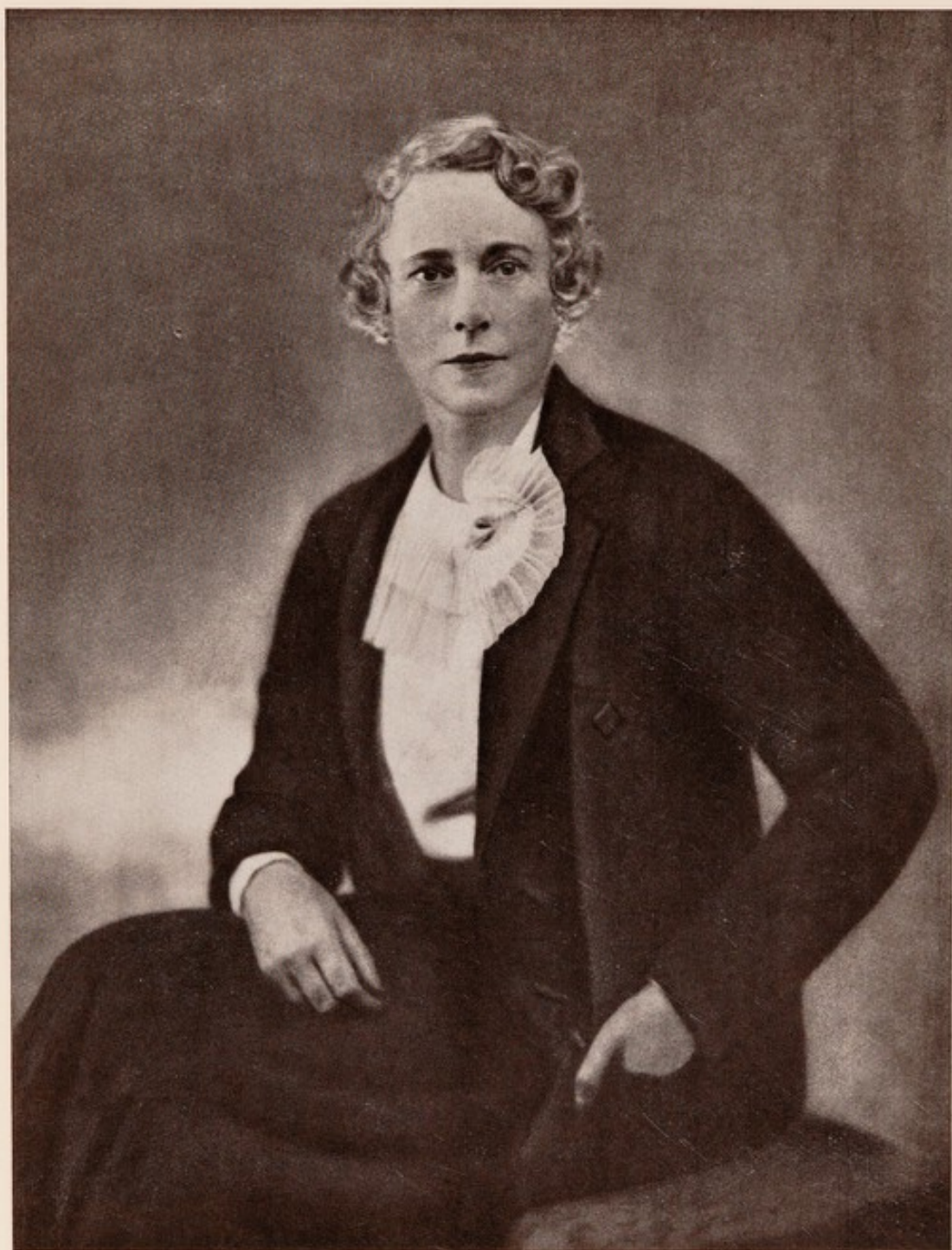
HER EXCELLENCY THE MARCHIONESS OF LINLITHGOW, C.I., PRESIDENT, COUNTESS OF DUFFERIN'S FUND, 1936.