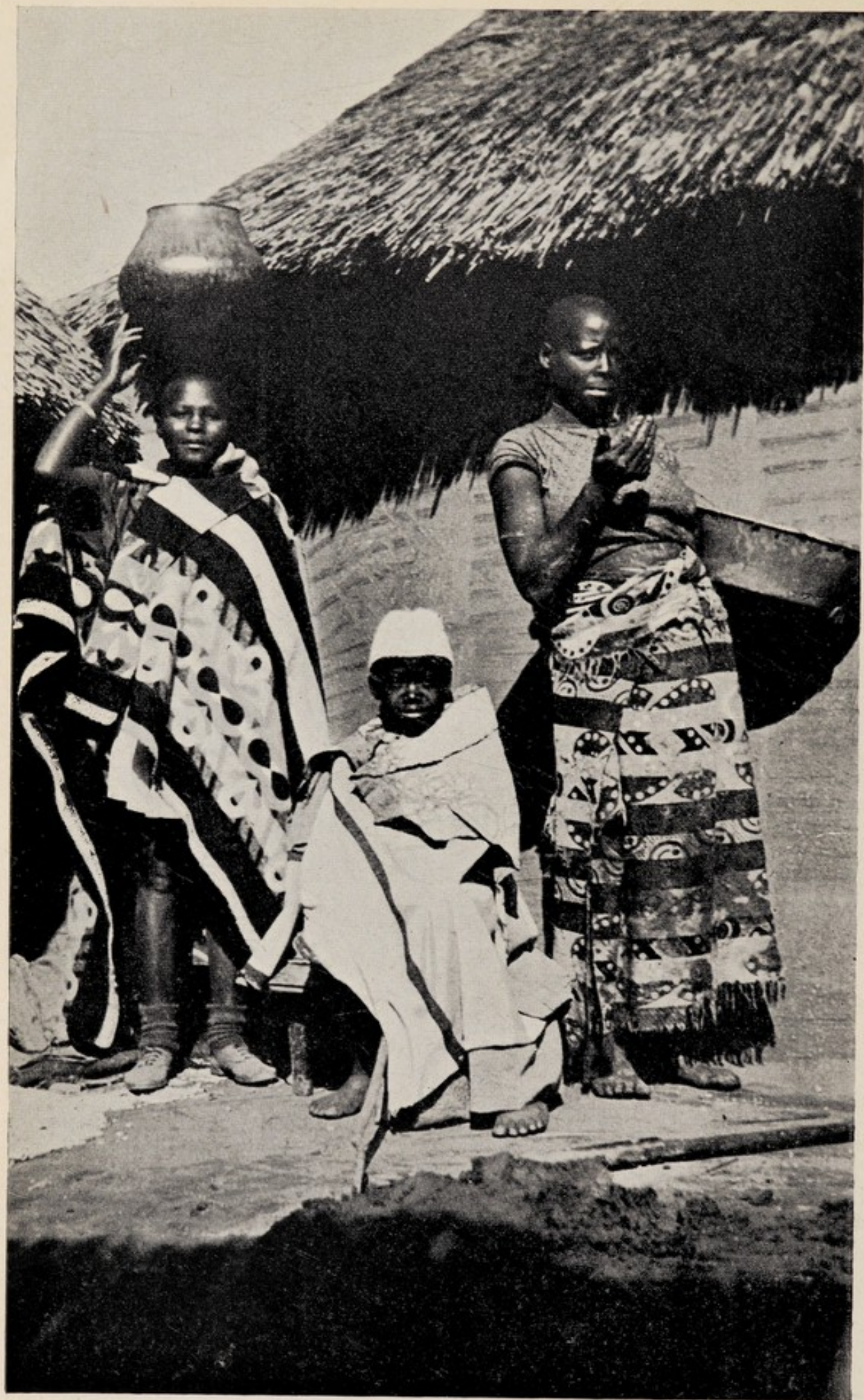
FAMILY LIFE. NOTE CURIOUS MIXTURE OF NATIVE BLANKET WITH EUROPEAN SOCKS AND GYM. SHOES