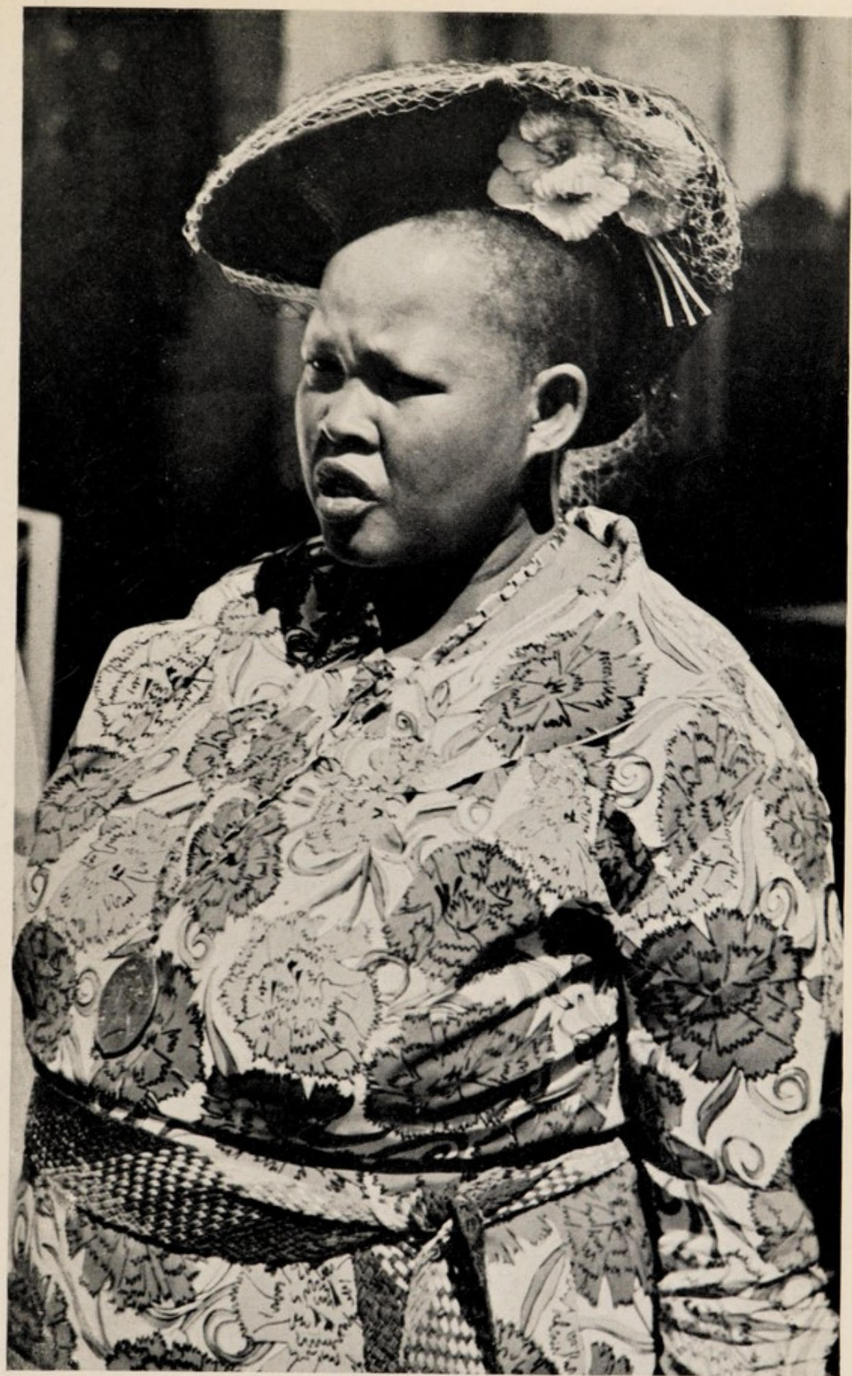
REGENT MANTSEBO SEEISO, AFTER SHE HAD RECEIVED THE O.B.E. FROM THE KING