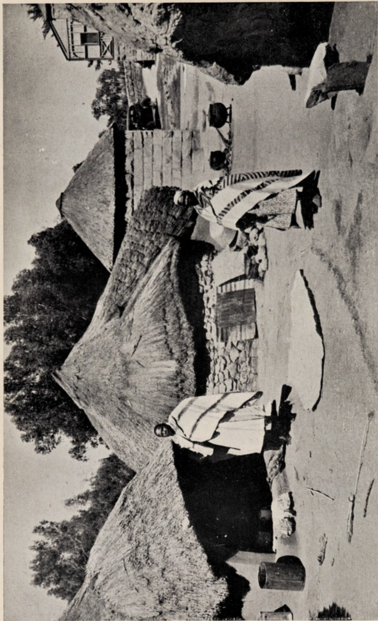
A NATIVE VILLAGE. FROM BUILDING MUD HUTS, THE BASUTO ARE LEARNING TO BUILD WITH SANDSTONE