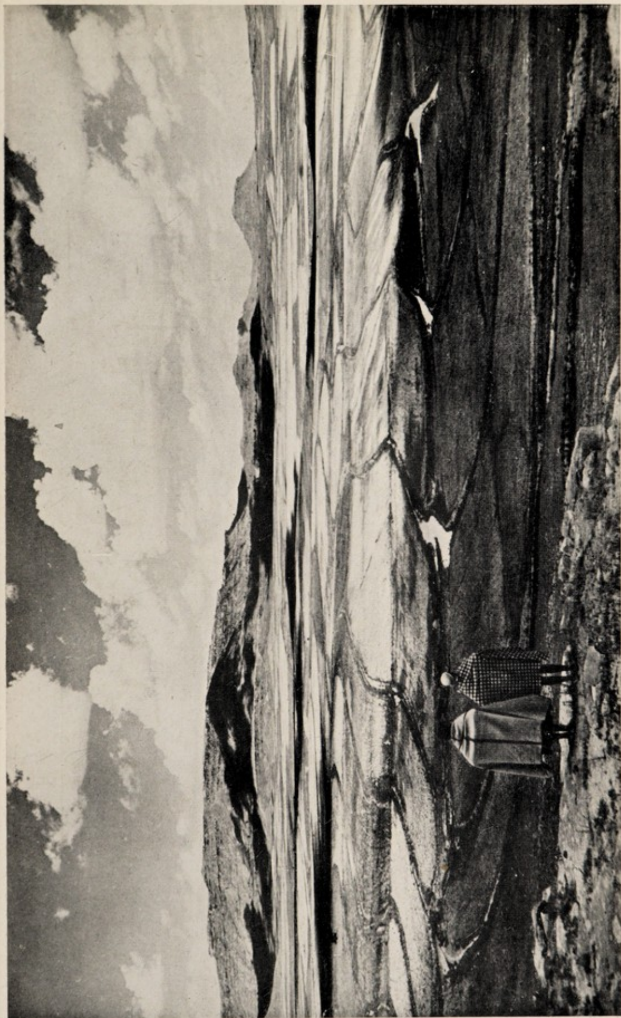
SAVING THE SOIL. A GENERAL VIEW OF THE SYSTEM OF CONTOUR FURROWS IN ONE OF THE MOUNTAIN VALLEYS