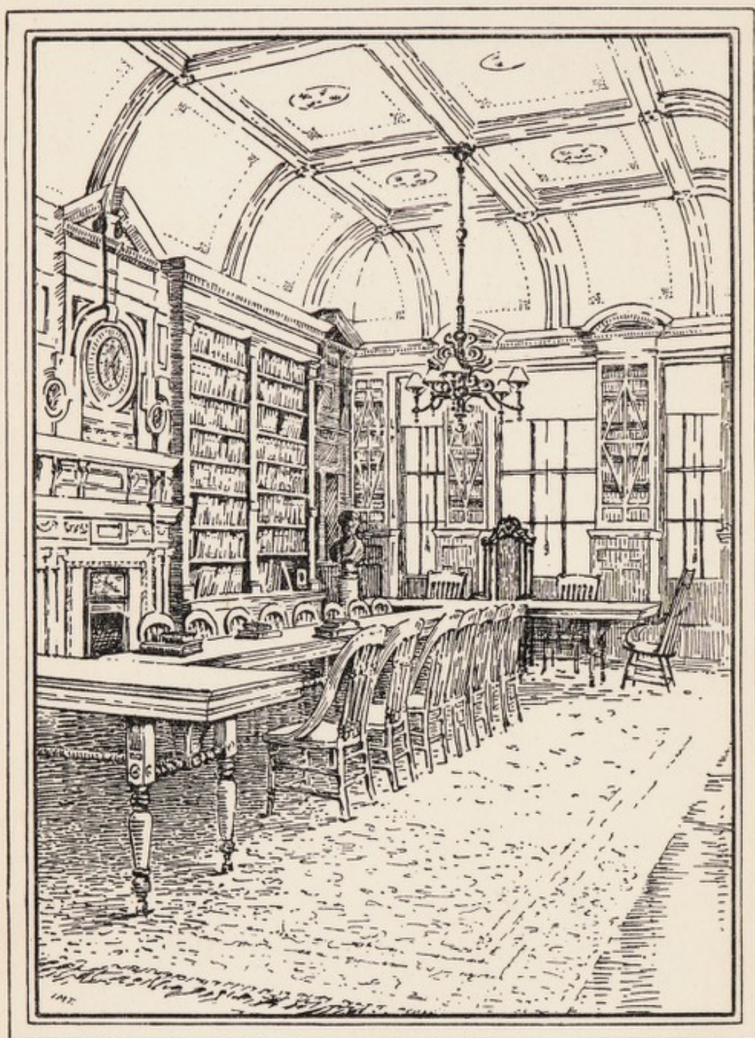
The Library, Royal Berkshire Hospital.