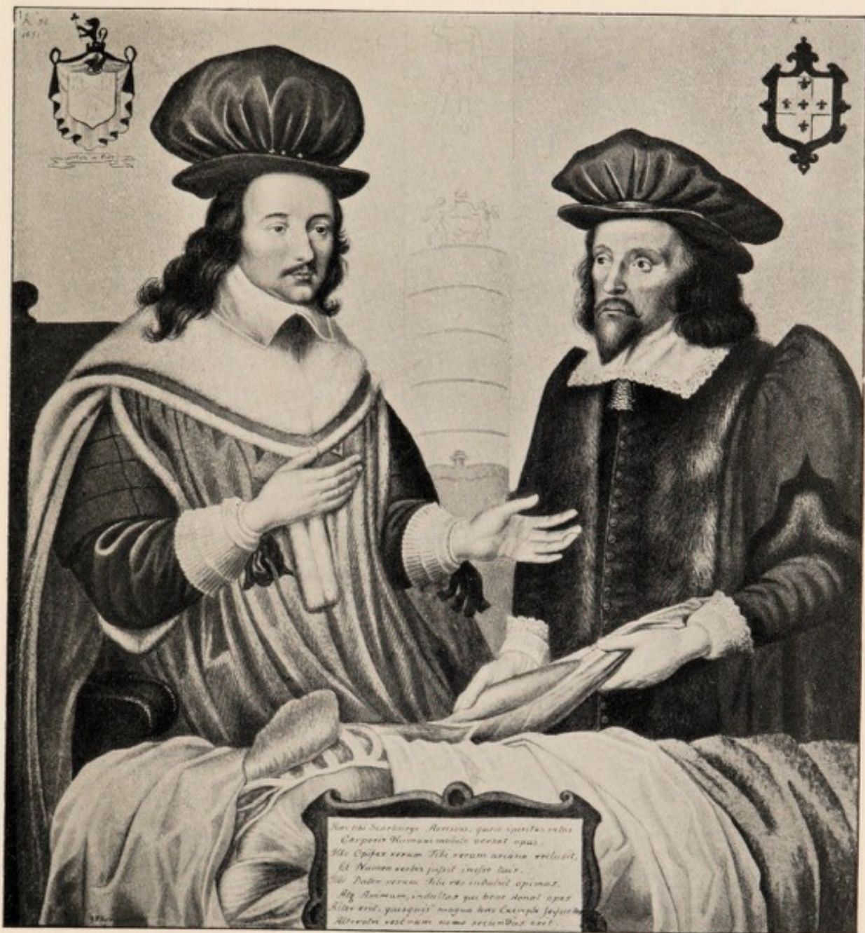
SIR CHARLES SCARBURGH WITH EDWARD ARRIS

From a water-colour copy, in the Royal College of Physicians, of the portrait in the Hall of the Barbers' Company