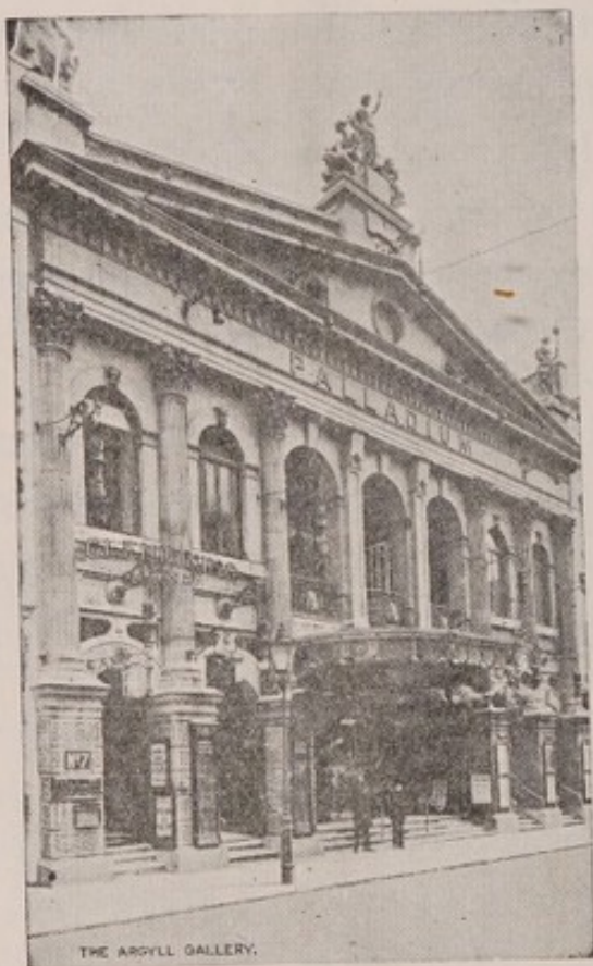
THE ARGYLL GALLERY, 7, ARGYLL STREET, OXFORD CIRCUS, W. 1.