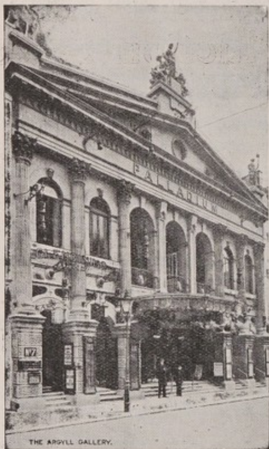
THE ARGYLL GALLERIES, 7, ARGYLL STREET, OXFORD CIRCUS, W. 1.