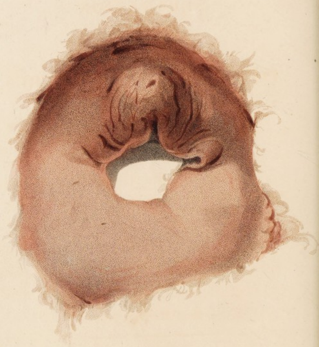
M r Scott's case of a separation of the Uterus.