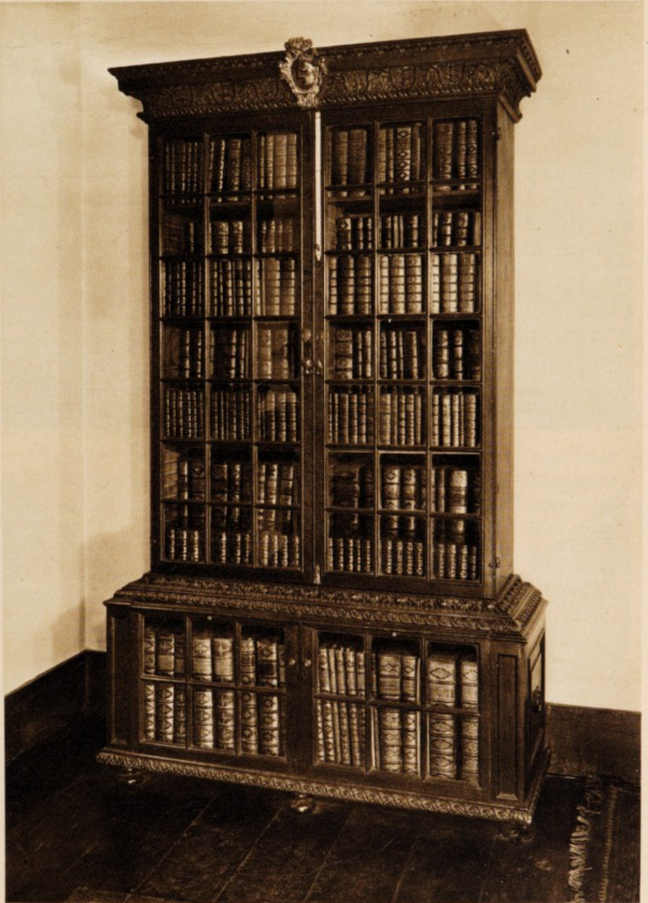
ONE OF THE PRESSES