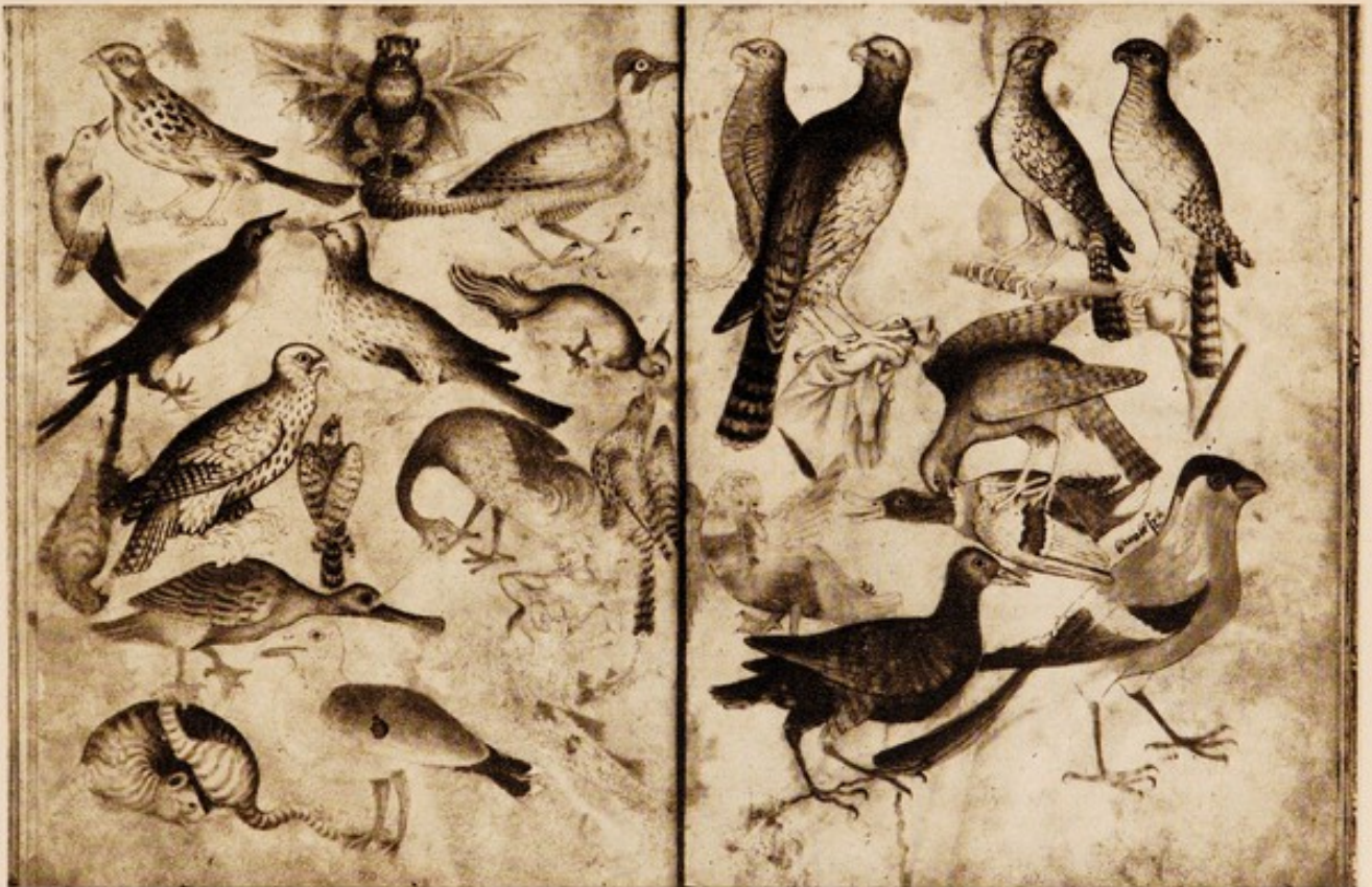
[B] TWO PAGES FROM THE MONKS' DRAWING BOOK