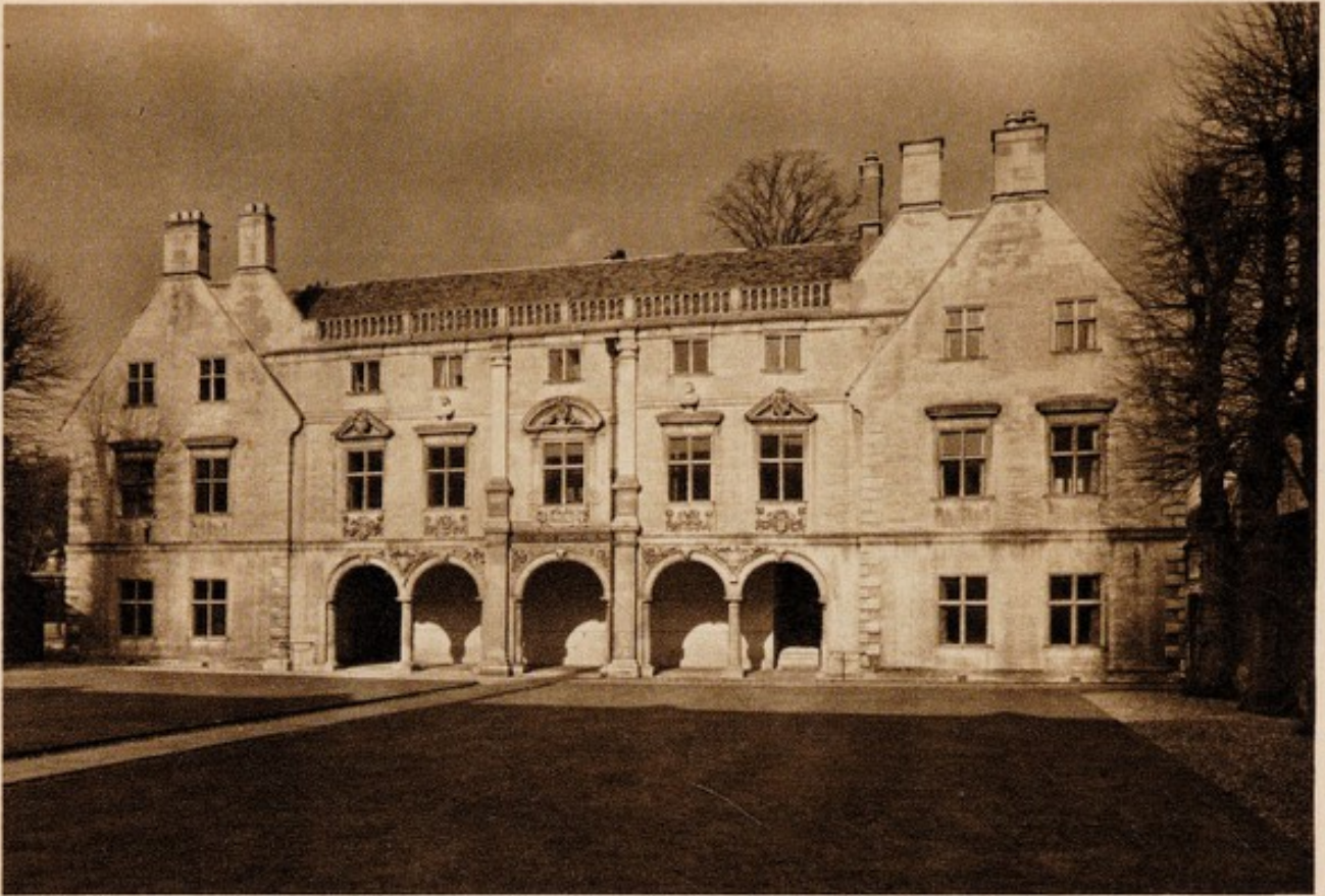
[A] THE PEPYS BUILDING