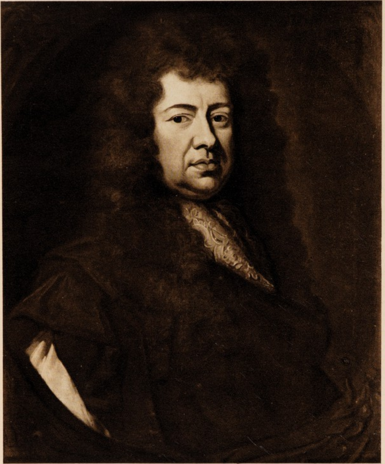
PORTRAIT OF SAMUEL PEPYS BY KNELLER