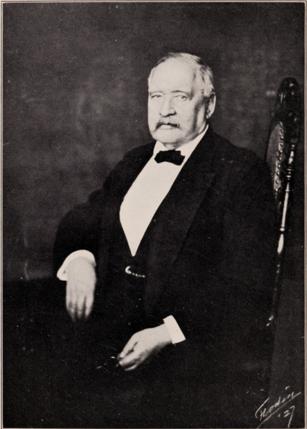
SVANTE AUGUST ARRHENIUS (1859-1927)