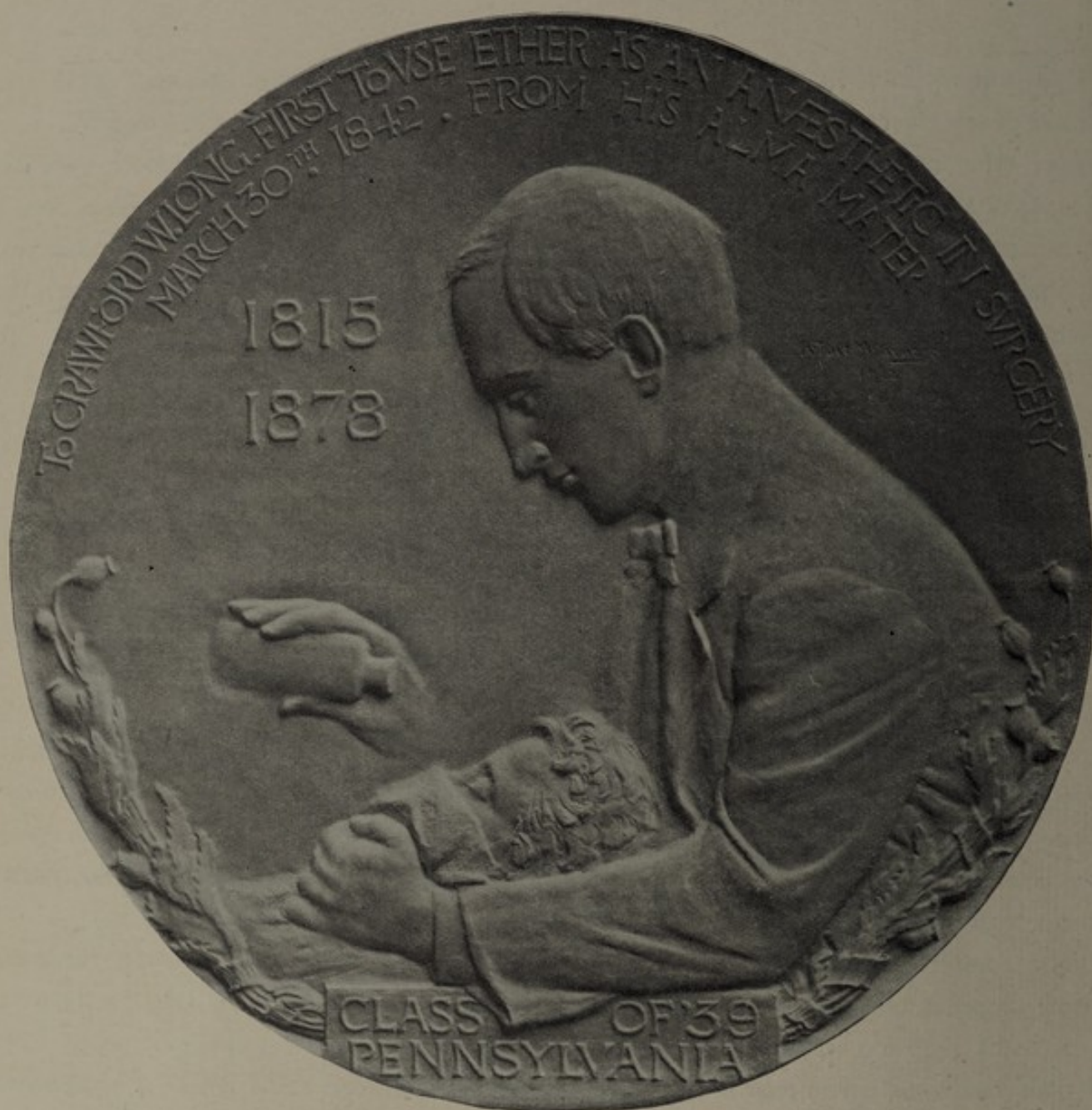
BRONZE MEDALLION UNVEILED IN THE MEDICAL BUILDING ON MARCH 30, 1912, TO THE MEMORY OF CRAWFORD W. LONG, WHO FIRST USED ETHER AS AN ANESTHETIC IN SURGERY.