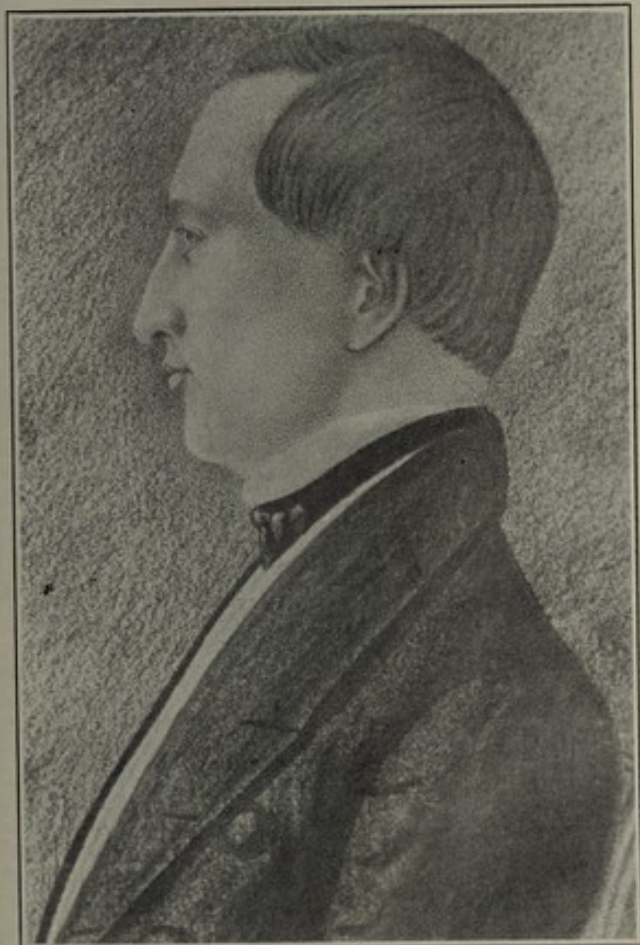
CRAWFORD W. LONG, '39 MED.