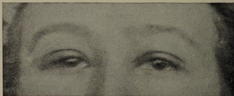
N. L. No. 3.

or no improvement, and the third is the final result after the right external rectus had also been advanced.