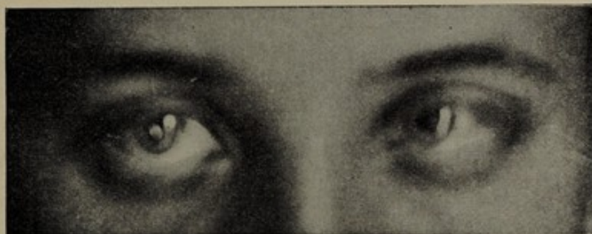
Miss P. L. before operation.

The amount of squint measured by projection and sexagesimal (not metre) tangents was nearly 20^{\circ} . The right eye alone was used for fixation, although at an earlier age the affection seems to have been alternating. Examination of the fields of fixation showed that of the right to be in all respects normal. The test-object used was a very small letter moved round the arc of a Priestley Smith's perimeter. The right eye