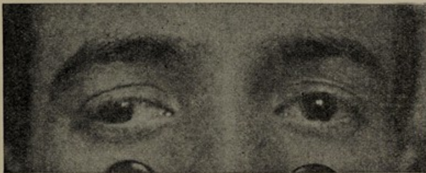
J. R. T. before operation.

Turning now to cases of ordinary strabismus divergens, I find that the results are equally good. I do not know in the whole range of ophthalmic practice a more satisfactory operation than advancement for divergent squint, unless it be in certain cases the same operation for the relief of asthenopia due to heterophoria.