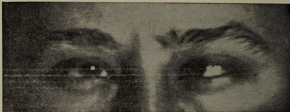
N. L. No. 2.

was operated on at all. The second was taken after the advancement of the left external rectus, and shows little